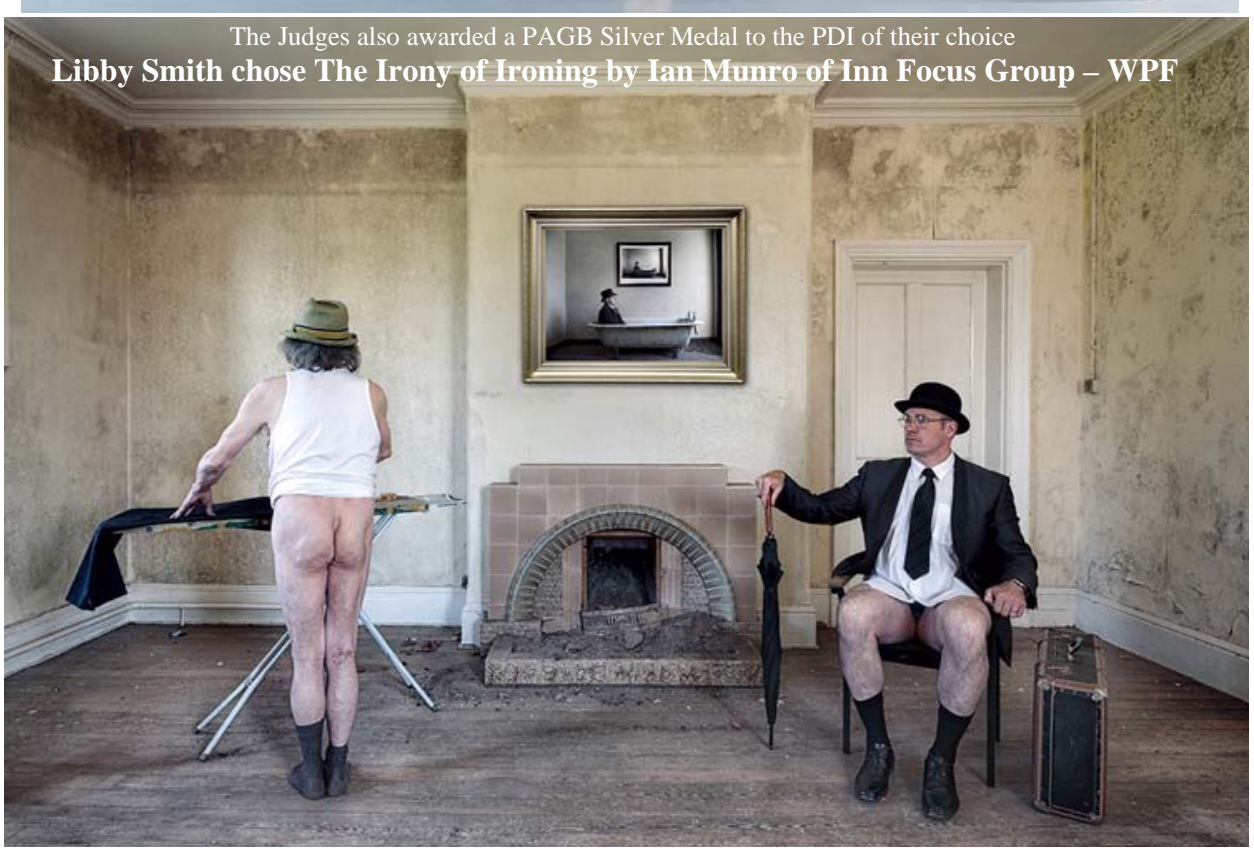
Page 3 e-news 95 Jul 2013