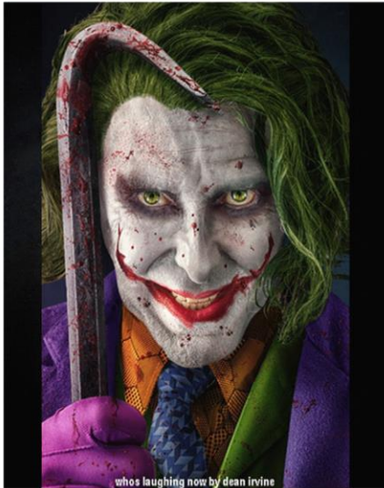
whos laughing now by dean irvine