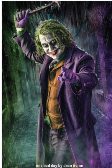
one bad day by dean irvine