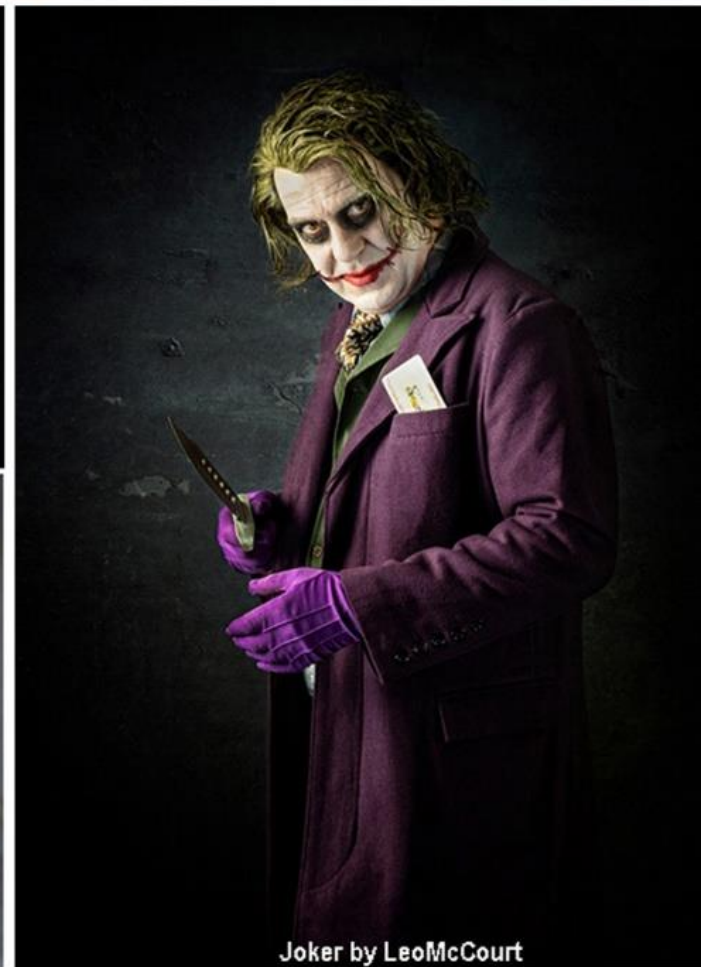
Joker

Session Days are one of the leading providers of affordable portraiture events and training workshops in the North West of England, open to all levels of photographic experience. Using unique locations such as a vintage spitfire hangar, Wild West Town, Stately Homes, Tudor Mansions and Art Deco Theatres, they source the finest models, actors and performers from across the UK. This enables them to provide a wide variety of photographic opportunities in a friendly atmosphere that has clients coming back time after time to create their own award winning images for local, national and international camera club competition successes and for PAGB, FIAP, and RPS awards.