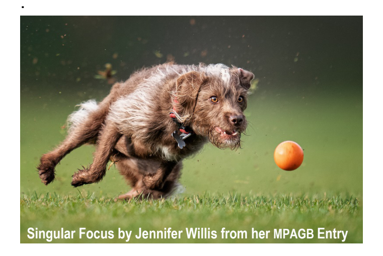
Photo prints can last longer than a lifetime and can be passed down through the generations to be shown or exhibited at any point in time. Photographs printed onto archival papers can be preserved almost indefinitely, to be displayed, enjoyed and connect with future generations. Rod Wheelans

Of course we enjoy images seen on social media platforms or in projected competitions, but these moments are transient. The beauty of a printed photo means that we have time to connect with and explore the meaning of the image before us. A print is a tactile reminder that can be shared with others, a moment to escape the digital distractions of screen images. There is so much more to appreciate with the texture and finish of the paper chosen and the careful mounting which points to the importance of the image. A print in your hand or on an exhibition wall can engage you far more than a flicker on a screen. It is an art form that won't be lost and you have an opportunity to add your magic.