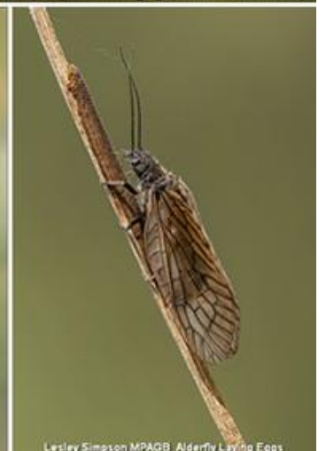
Lesley Simpson MPAGB_Alderfly Laying Eggs

CLICK ON the pictures to see them bigger on our website.