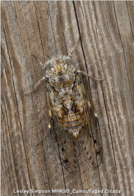
Lesley Simpson MPAGB_Camouflaged Cicada