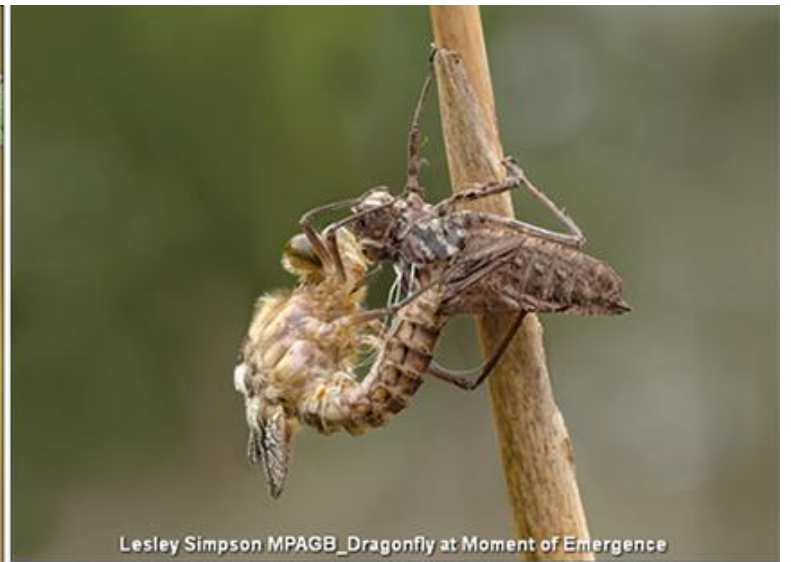
Lesley Simpson MPAGB_Dragonfly at Moment of Emergence