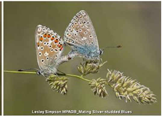
Lesley Simpson MPAGB_Mating Silver-studded Blues