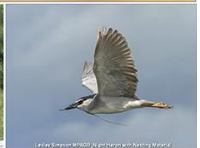
Lesley Simpson MPAGB_Night Heron with Nesting Material