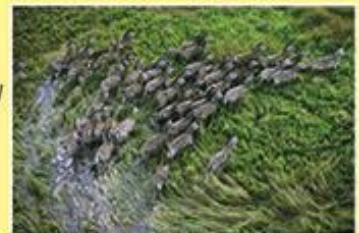
Aerial view of zebra herd running through swamp, Okavango Delta, Botswana