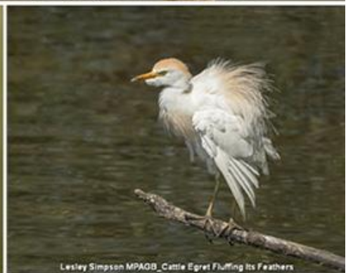
Lesley Simpson MPAGB_Cattle Egret Fluffing Its Feathers