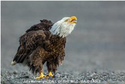
Julia Wainwright_CALL OF THE WILD - BALD EAGLE