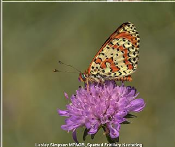
Lesley Simpson MPAGB_Spotted Fritillary Nectaring