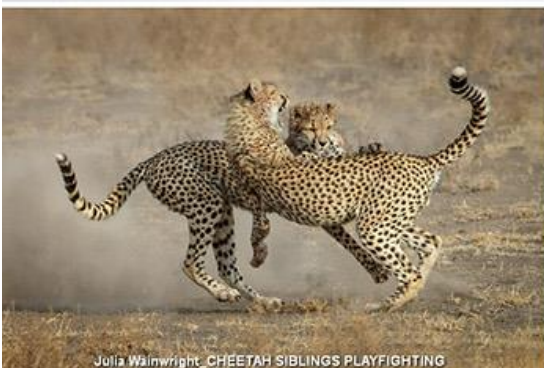
Julia Wainwright_CHEETAH SIBLINGS PLAYFIGHTING