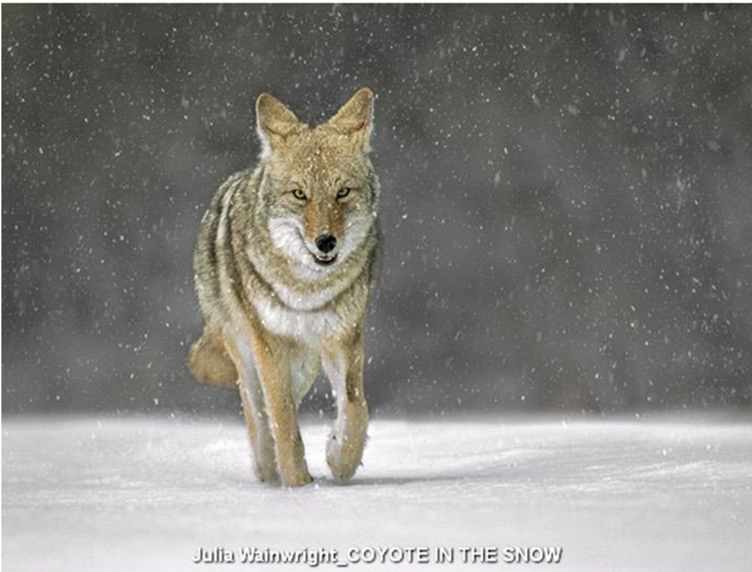
Julia Wainwright_COYOTE IN THE SNOW