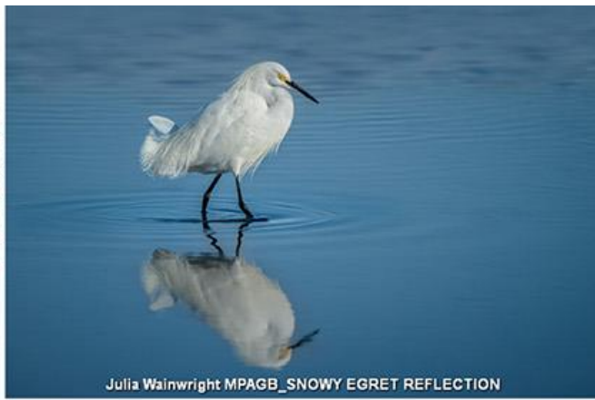
Julia Wainwright_MPAGB_SNOWY EGRET REFLECTION