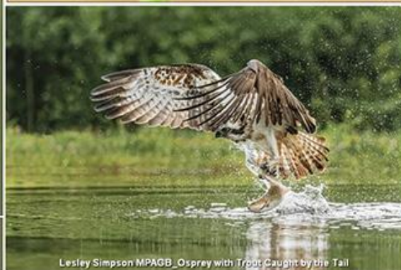
Lesley Simpson MPAGB_Osprey with Trout Caught by the Tail