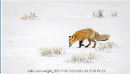
Julia Wainwright_RED FOX SEARCHING FOR PREY