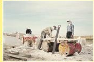
From the series Caspian: the Elements