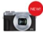
PowerShot G7 X Mark III Compact