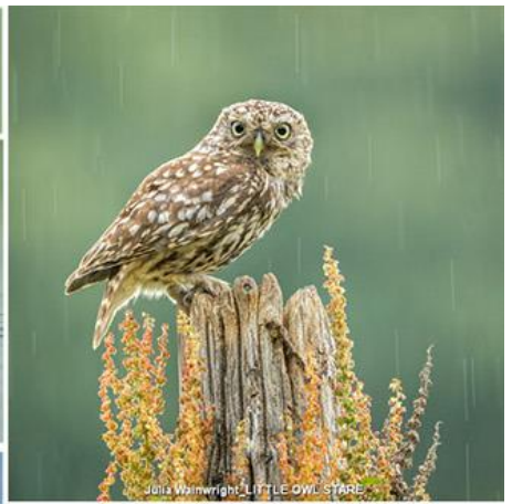
Julia Wainwright_LITTLE OWL STARE