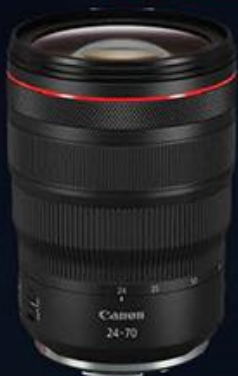
RF 24-70mm f/2.8L IS USM

https://www.canon.co.uk/lenses/rf-lenses/