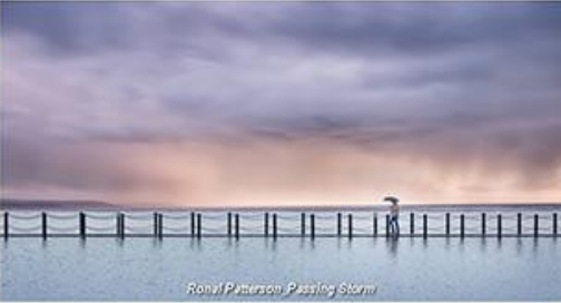
Ronal Patterson_Passing Storm