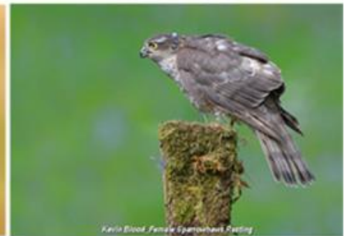
Kevin Blood Female Sparrowhawk Resting