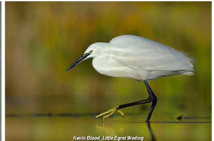
Kevin Blood Little Egret Wading