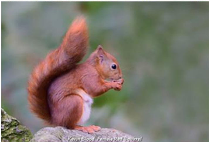
Kevin Blood Female Red Squirrel