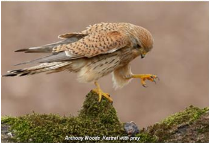
Anthony Woods_Kestrel with prey