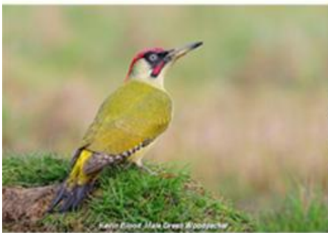
Kevin Blood Male Green Woodpecker