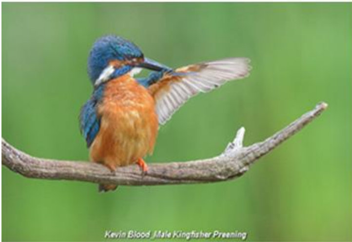
Kevin Blood Male Kingfisher Preening