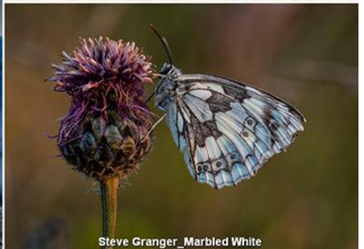
Steve Granger_Marbled White