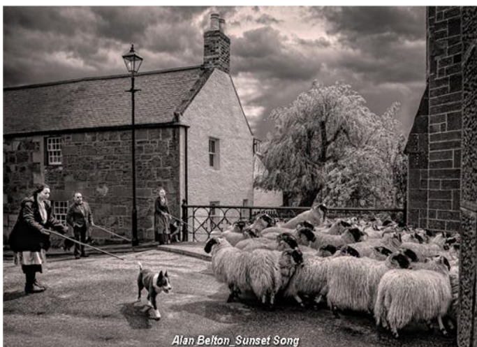
Alan Belton_Sunset Song