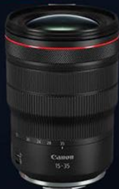
RF 15-35mm f/2.8L IS USM