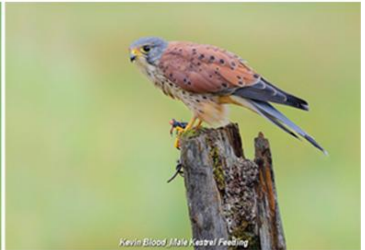
Kevin Blood Male Kestrel Feeding