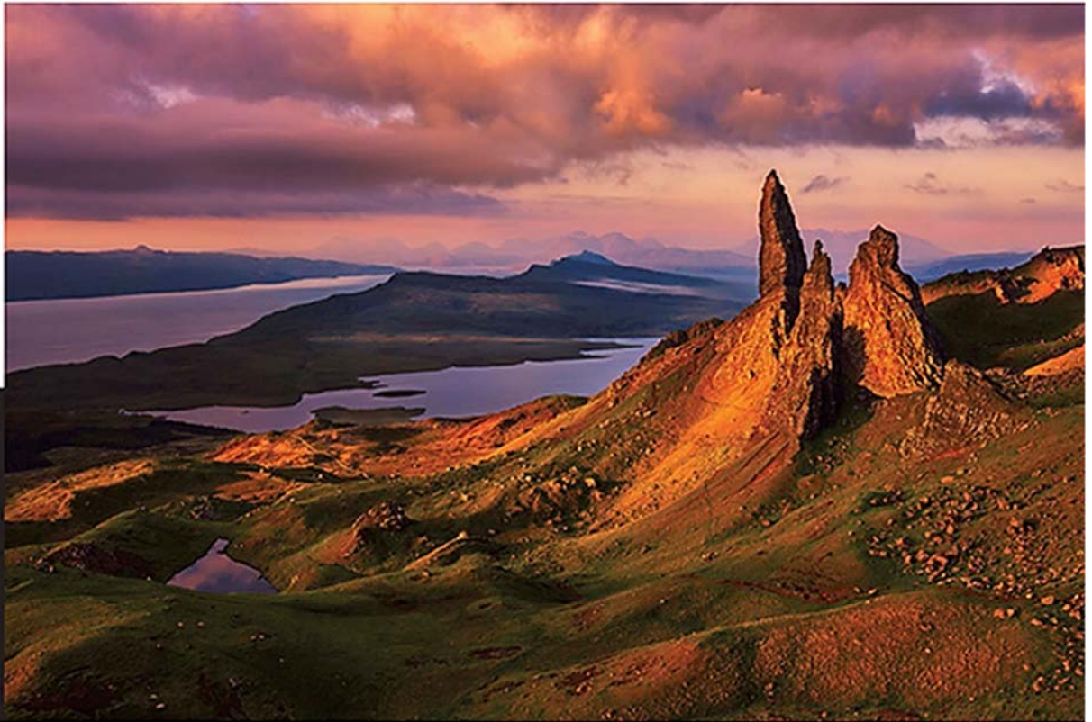
The Old Man of Storr at sunrise

Andreas Ettl Digital Splash Awards Landscape 2017 Finalist