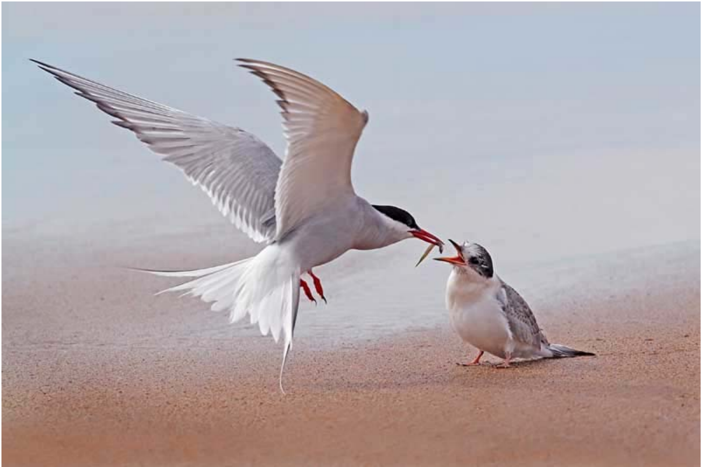
Paul Keene, Arctic Tern feeding chick