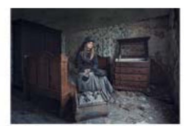
We Don't Play Anymore by Coltrane Koh