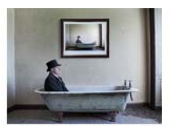
Watching You Watching Me by Ian Munro