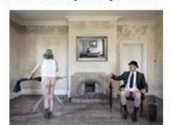
The Irony Of Ironing by Ian Munro