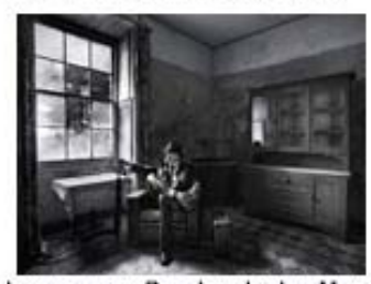
The Journeyman Ponders by Ian Munro