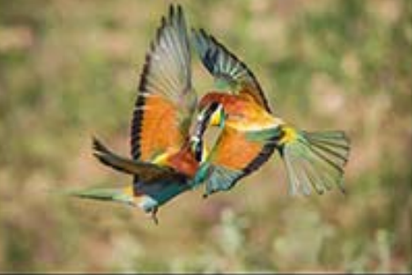
08 CP1399 Beceaters kissing.jpg