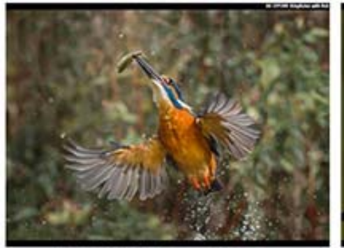
04 CP1399 Kingfisher with fish.jpg