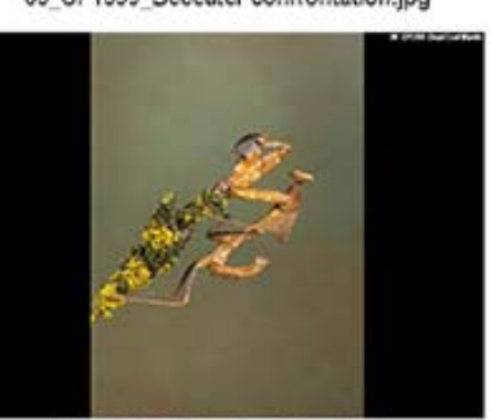
06_CP1399_Dead Leaf Mantis.jpg