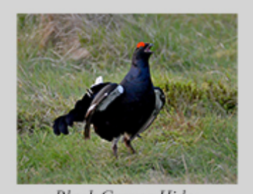
For more information Gordon Rae DPAGB

(Sales - Tuition - Hide Hire - Photography Tours)