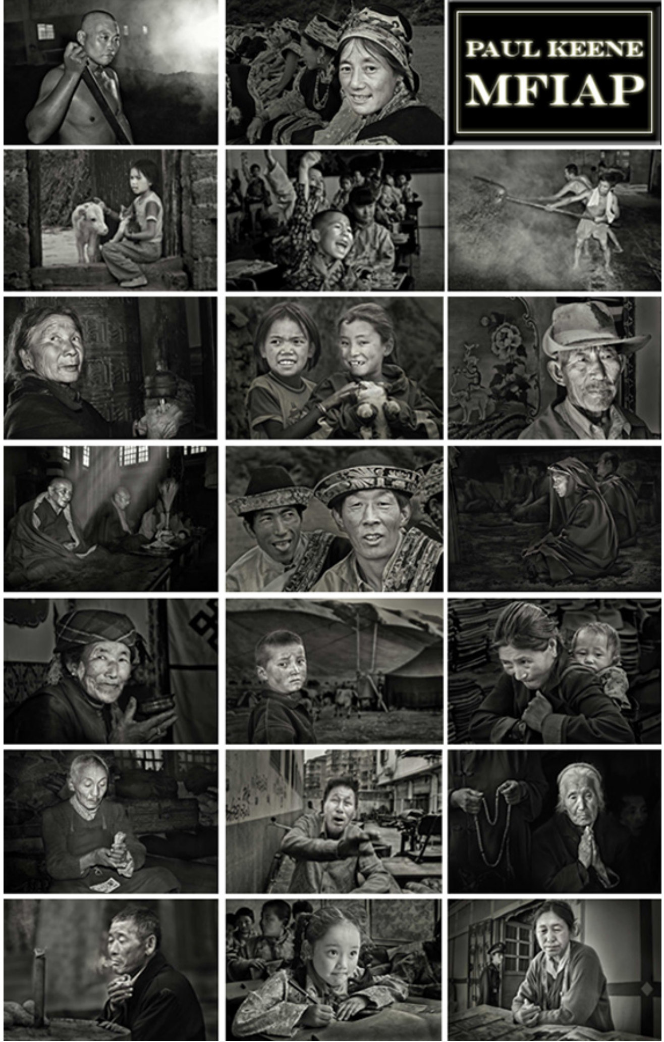
Page 4, e-news 123, Aug 2014