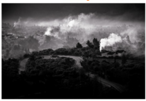
Morning Fires - Orgiva, Granada December 2013 Learn Grow and Flourish