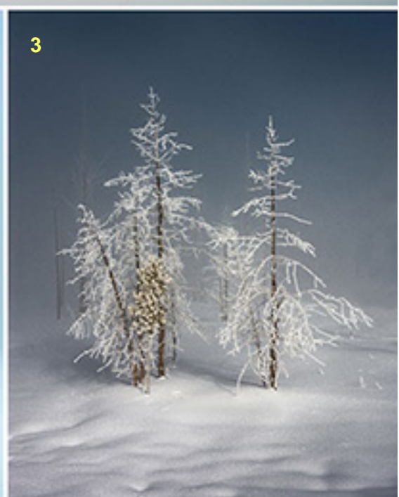
1. The Lone Tree 2. Trees in Mist 3. Frosted