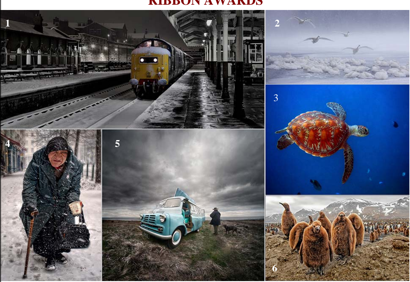
As promised in the last issue here are more of the Award Winning pictures from the Inter-Federation PDI Competition