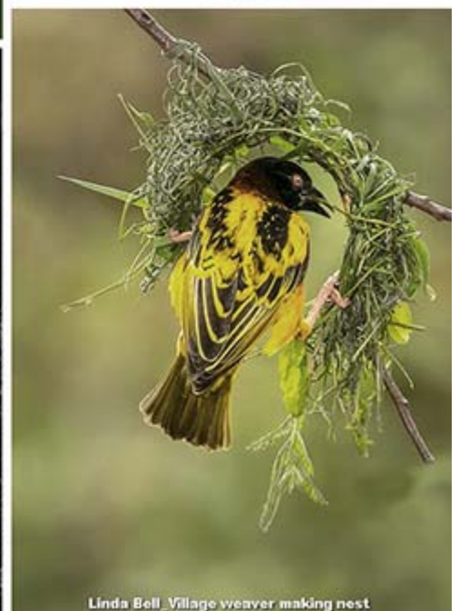
Linda Bell_Village weaver making nest