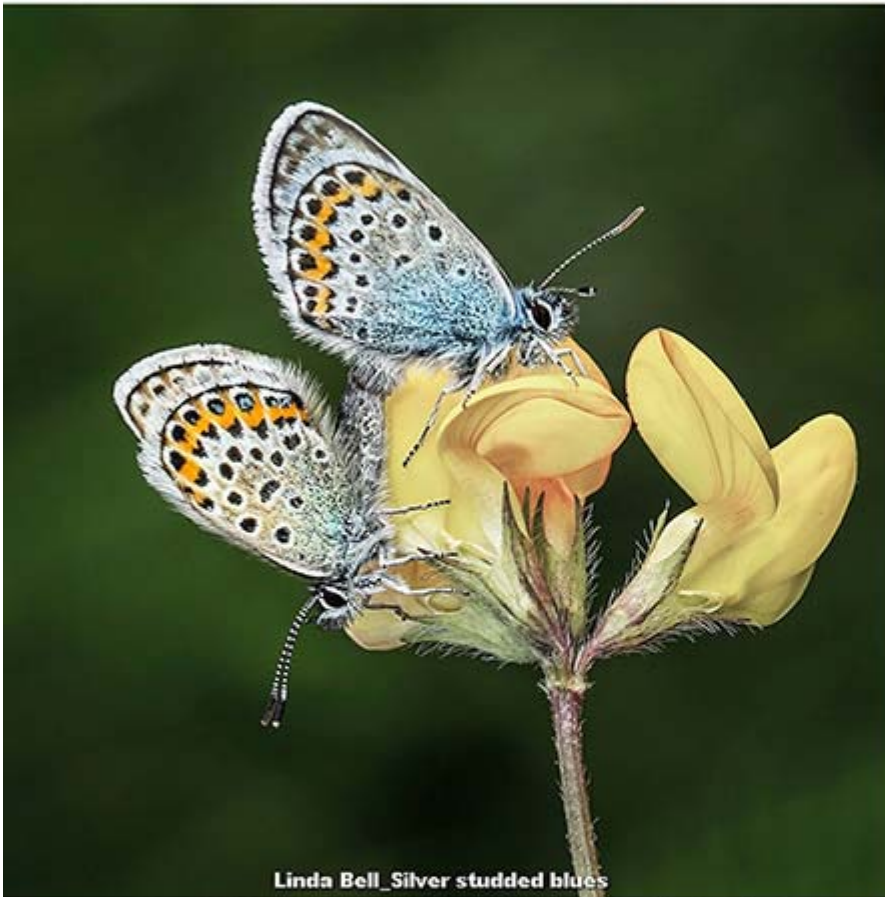
Linda Bell_Silver studded blues