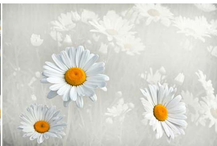
Daisies – shadows and highlights to lighten the dark areas, some cloning, masking the main flower heads and airbrushing the background. Reduced the greens with Hue and Saturation layer, then more airbrushing and white layers to finish.