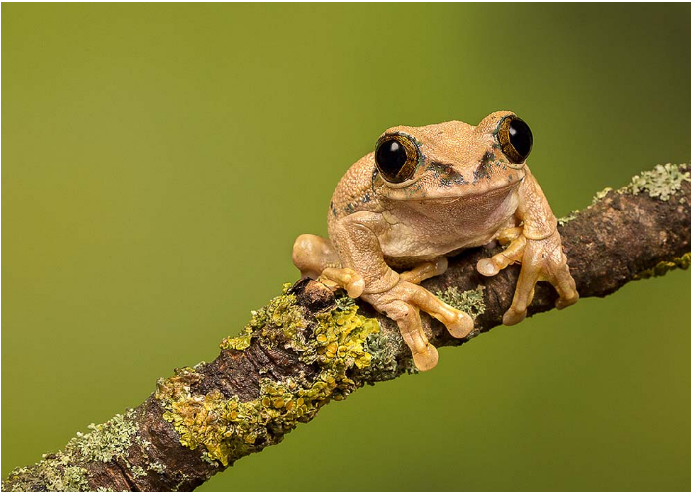
Female Peacock Tree Frog by Linda Bell