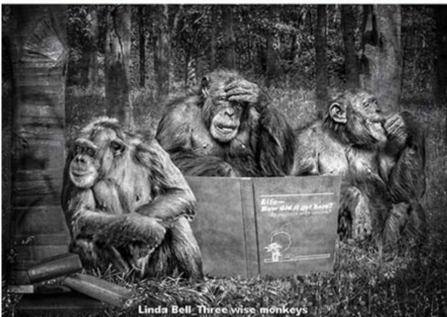
Linda Bell_Three wise monkeys