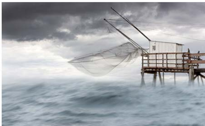
Fishing Hut - selective levels to bring out the hut. Selective white layers to keep the sky stormy, then add sea from another image to cover the grass, reduced opacity mono layer on the sea and two blur layers on the net to imply wind.