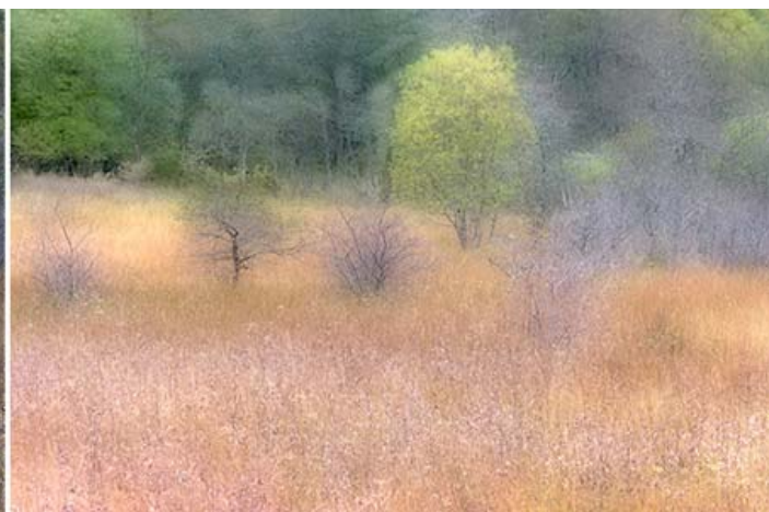
Marshland – again a dull day but with possibilities in the shapes and golden grasses. Blur layer to soften the scene, cloning the tree blocking the main tree, another blur layer and white layers.

On the day, I will show you will see full details of how I worked towards the final image and you will see the layers that I have used to effect the gradual transition.