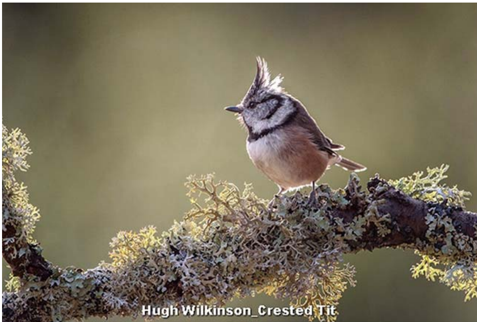
Hugh Wilkinson_Crested Tit