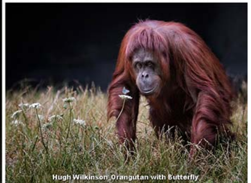
Hugh Wilkinson_Orangutan with Butterfly