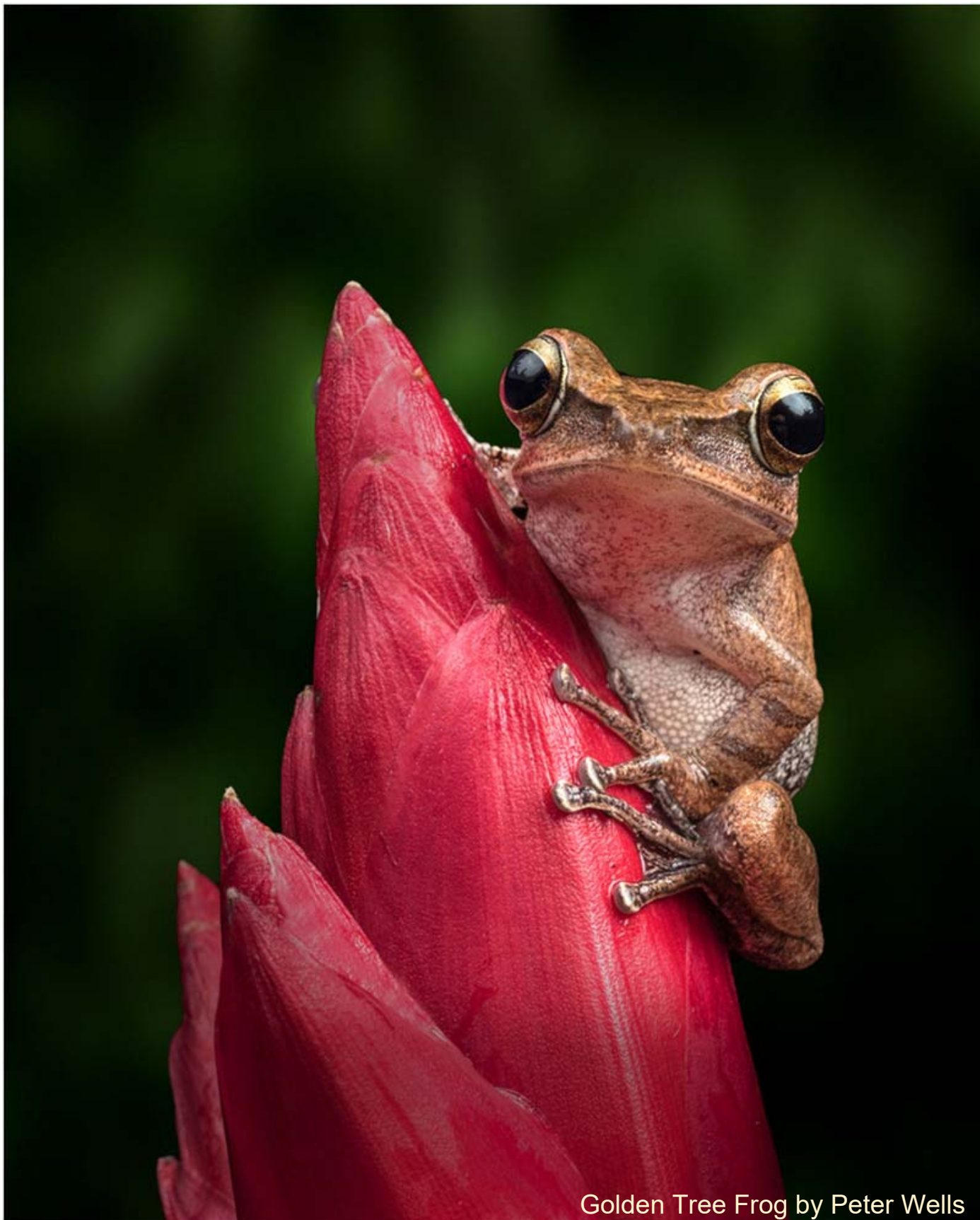
Golden Tree Frog