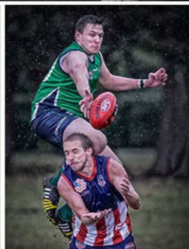
CLICK ON the pictures to view them more comfortably on our website, together with their titles and the names of the photographers.