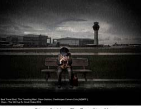
Diane Seddon_The Travelling Man