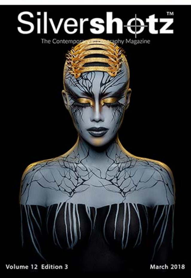
Third place environmental portrait