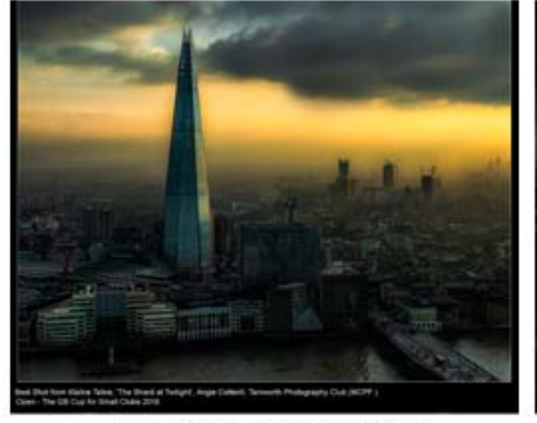
Angie Cotterill_The Shard at Twilight