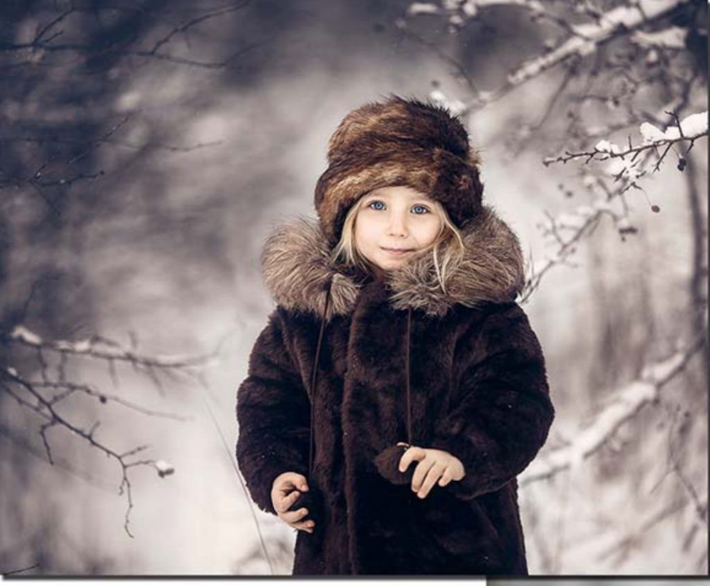
2017 Photographer of the Year