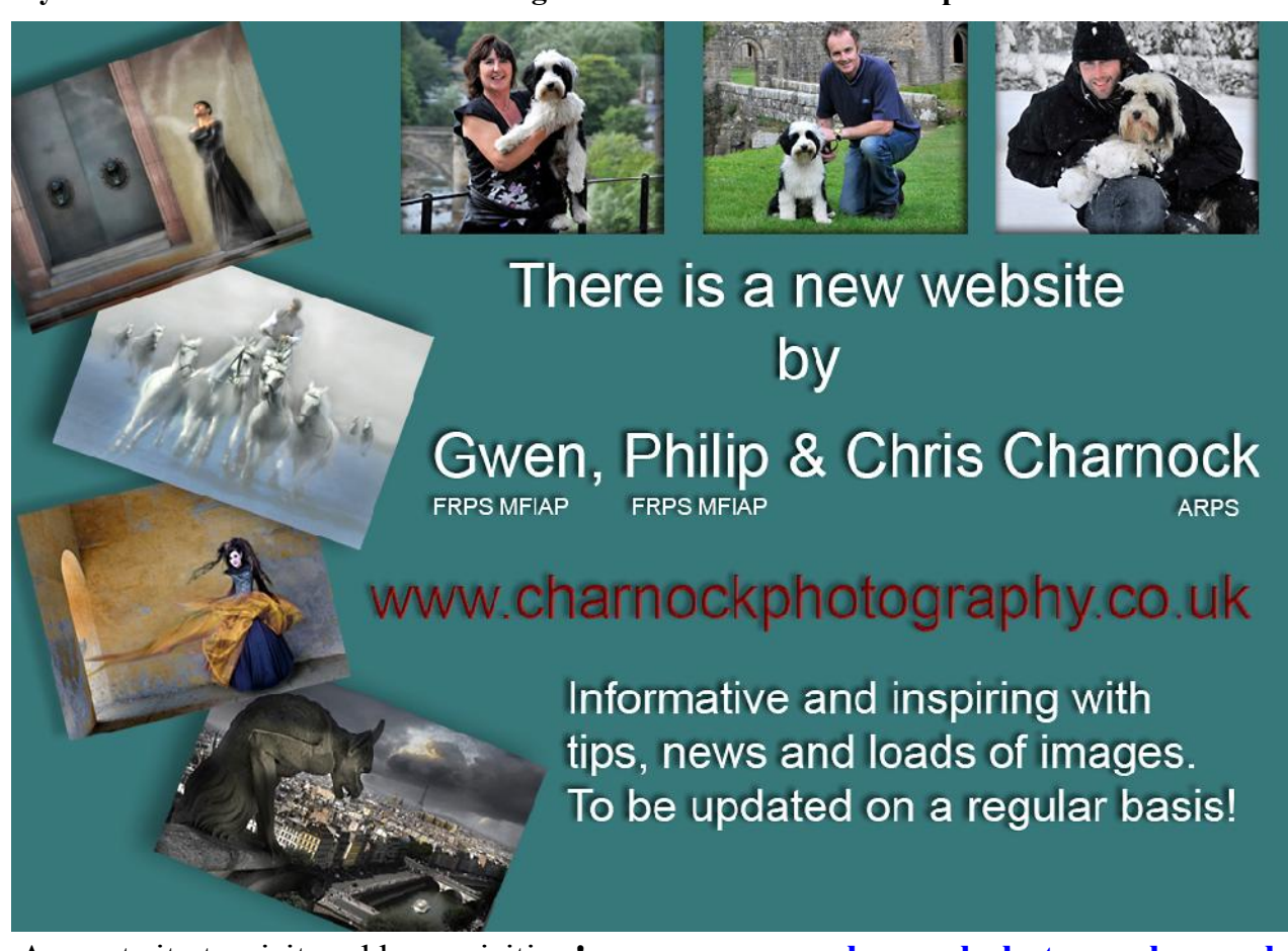
A great site to visit and keep visiting!