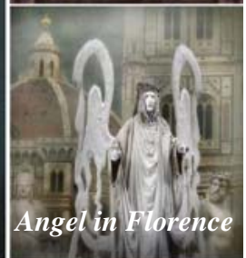
Angel in Florence