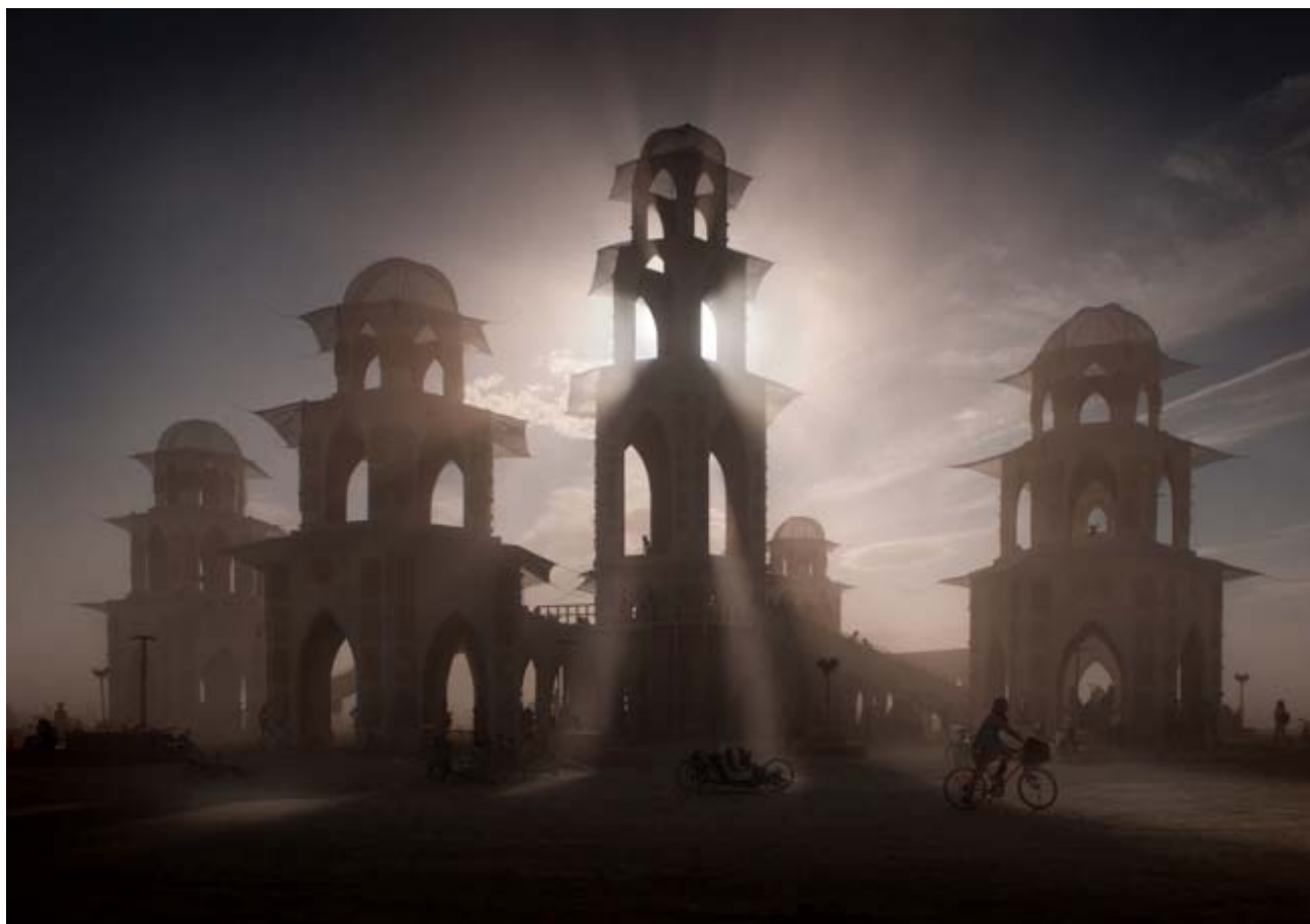
The Temple - Peter Gordon. See page 10