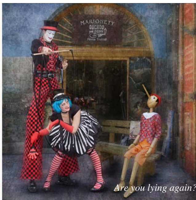
Are you lying again?

I was keeping a running total as the judging progressed and by the end I was some points short of the required amount. Where had I gone wrong? Depressed - No. Confused - Yes. My mind was now elsewhere thinking of how quickly can I pick up my prints- where shall we eat tonight – the long drive home- I wonder what the score was with Dundee and St. Mirren. (Ed: It was a 0 : 0 draw)