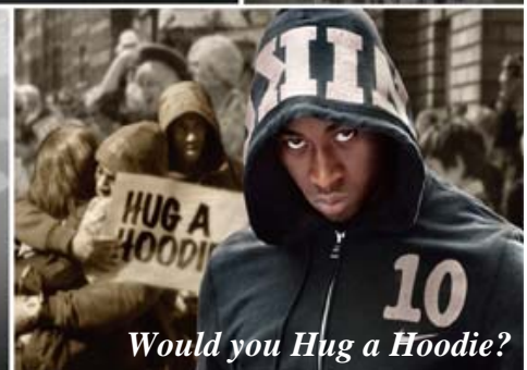
Would you Hug a Hoodie?