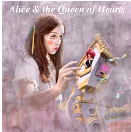
Alice & the Queen of Hearts

Getting 10 award winning prints over the next 10 months was never going to be easy but attending the SPF Advisory Days was a big help, along with advice from fellow photographers. I ended with about 45 to choose from and whittled it down to 20. After all the advice has been given the ultimate choice is down to yourself. When I eventually nominated my entry, all that was left to do was to sit back and relax. It was now out of my hands.