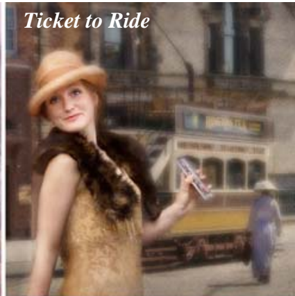
Ticket to Ride