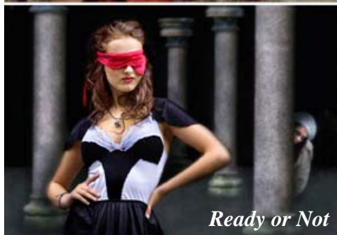
Ready or Not