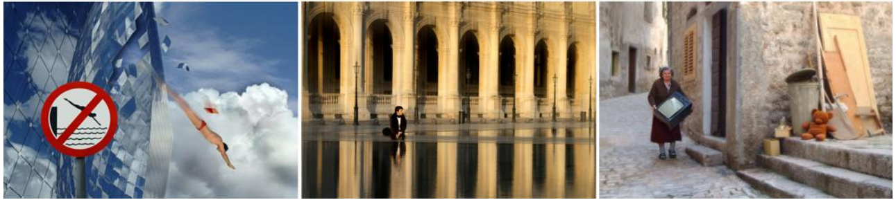
Chevalier, Deception, Shattered Dreams, Reflecting & Lady in Rovinj - Croatia by Gwen Charnock