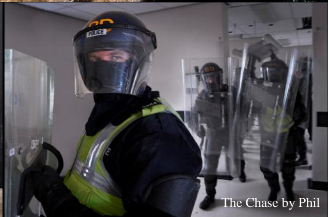
The Chase by Phil