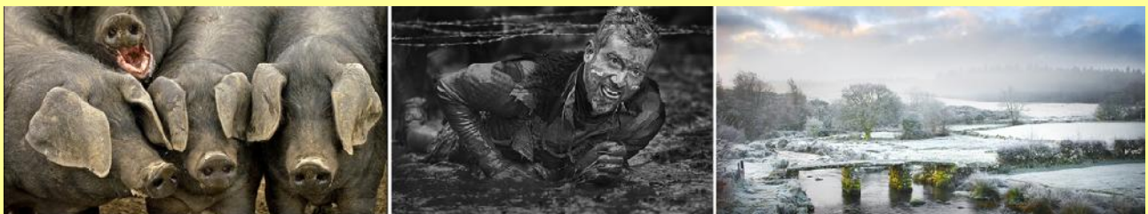
Award Winners in the 2012 GB Cup Small Clubs

Last chance to view the Inter-Federation Print Exhibition 2012 > The Turnpike Gallery, in Leigh – now until the 20th of December http://www.wlct.org/Arts-and-Festivals/turnpike-gallery/turnpike-gallery.htm