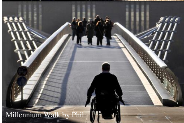
Millennium Walk