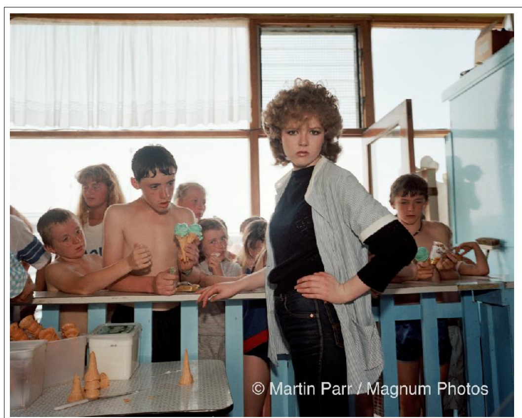
Mold C.C. Golden Jubilee Lecture

< Resort 1983 England. New Brighton from 'The Last -85'