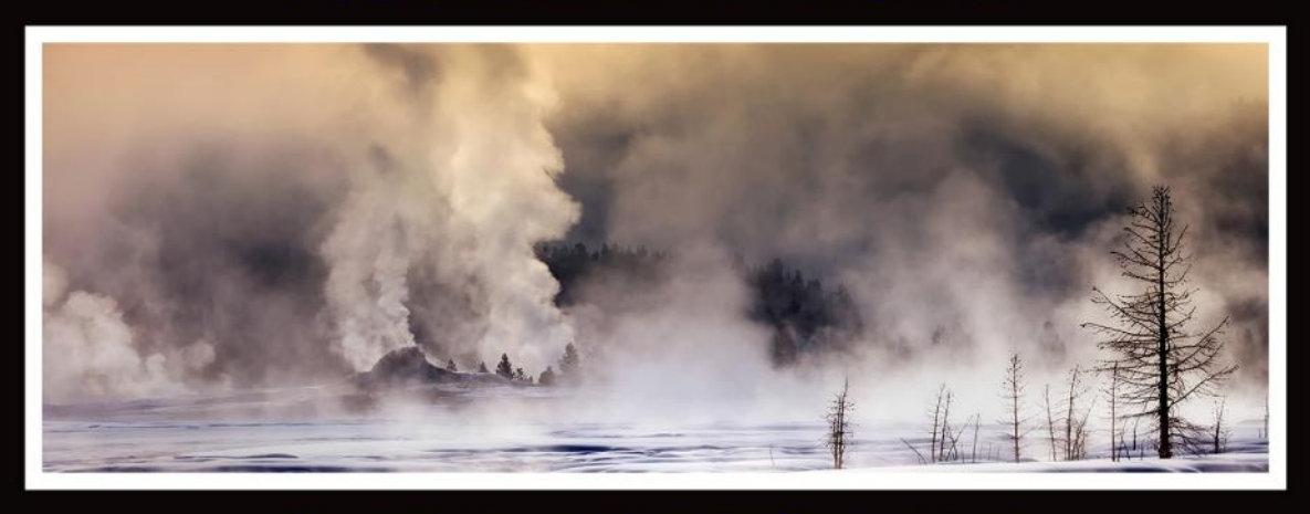
A LANDSCAPE AND WILDLIFE EXTRAVAGANZA JANUARY 20TH ~ 31ST AND FEBRUARY 3RD ~ 14TH 2013