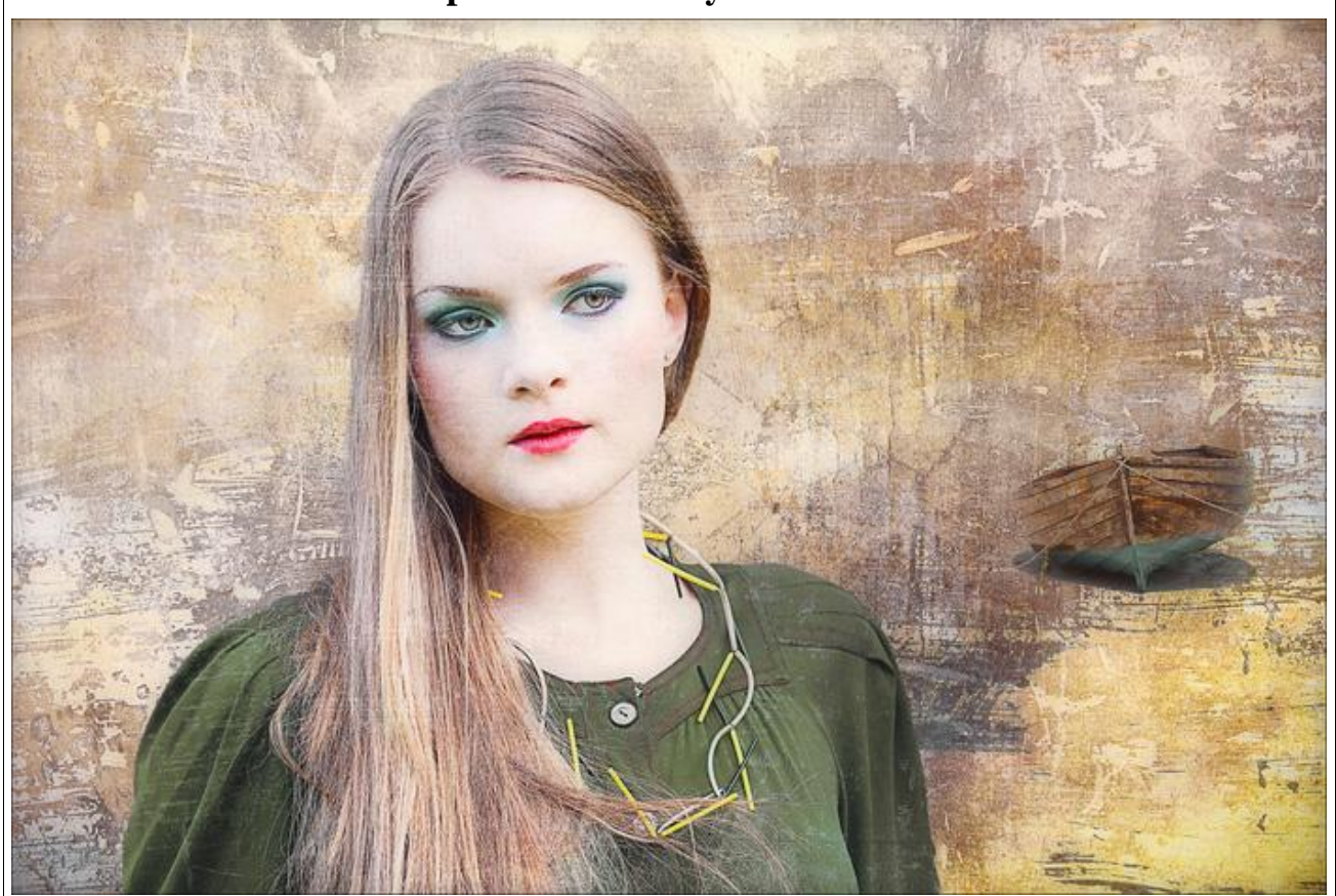
Top. Through the Mist – Hazel Bottom. Island Memories - Colin

Although we approach our photography from different perspectives it encompasses our shared interests of art, the natural world, our garden and the computer. Now retired, we have the time and opportunities to take photographs and manipulate them on the computer, creating pictures which reflect our individual interpretation and style.