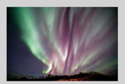
ICELAND Northern Lights & Winter Landscape February 14th-19th 2013

PAGB Policy is to advertise only those events of interest beyond your own Federation. This is really a local Mold event not covered by this policy but your Editor could not resist running a photograph by Martin Parr in e-news!