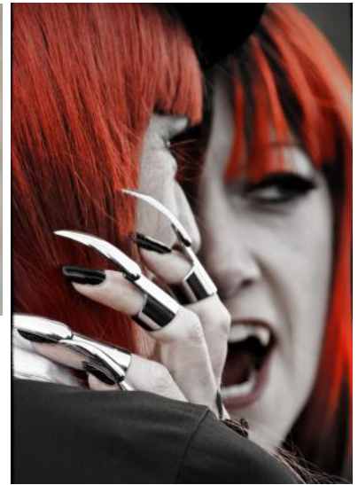
Seascape, Oliver & Vampires by Saskia Slavin LRPS

http://www.flickr.com/photos/45931226@N02/