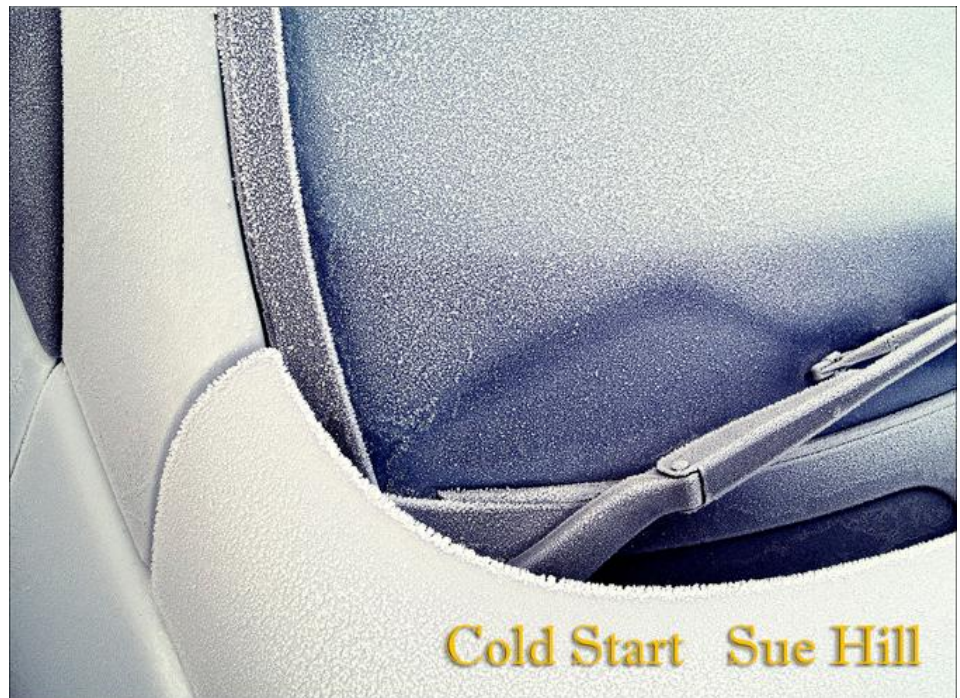
Cold Start Sue Hill

CPAGB & DPAGB photographs as they appear in the APM AV show on CD.