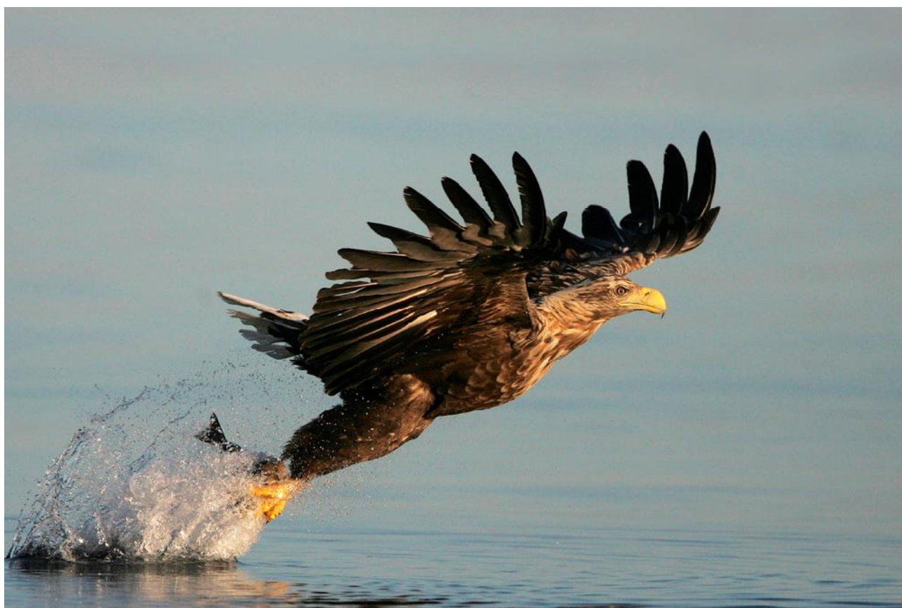
WHITE TAILED SEA EAGLE BY GORDON BRAMHAM