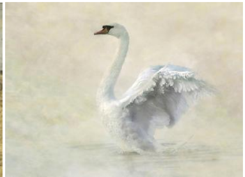
Swan Impression Grand Canal Venice