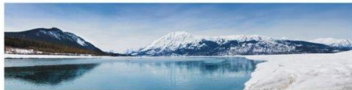
▲ Pinnacle Panoramic size 210x594mm