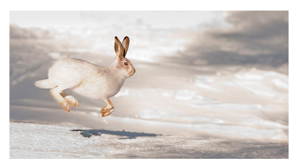
Snowshoe Hare in Flight