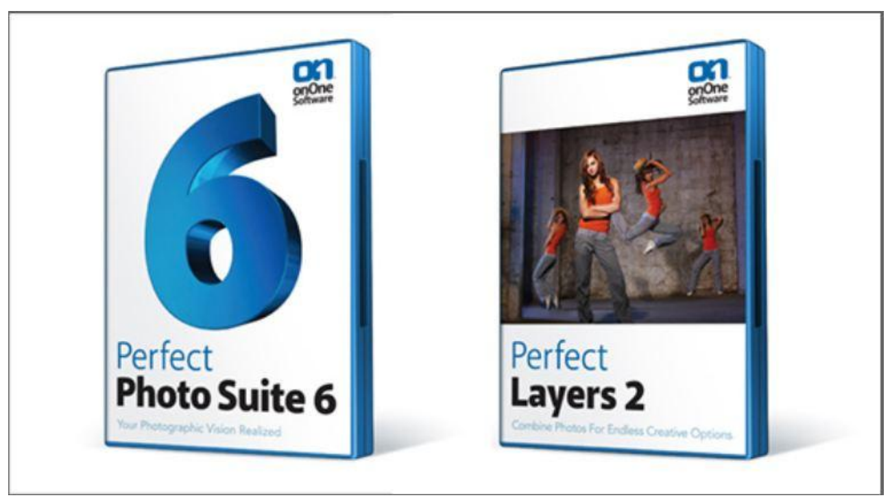
See OnOne at Focus on stand E11