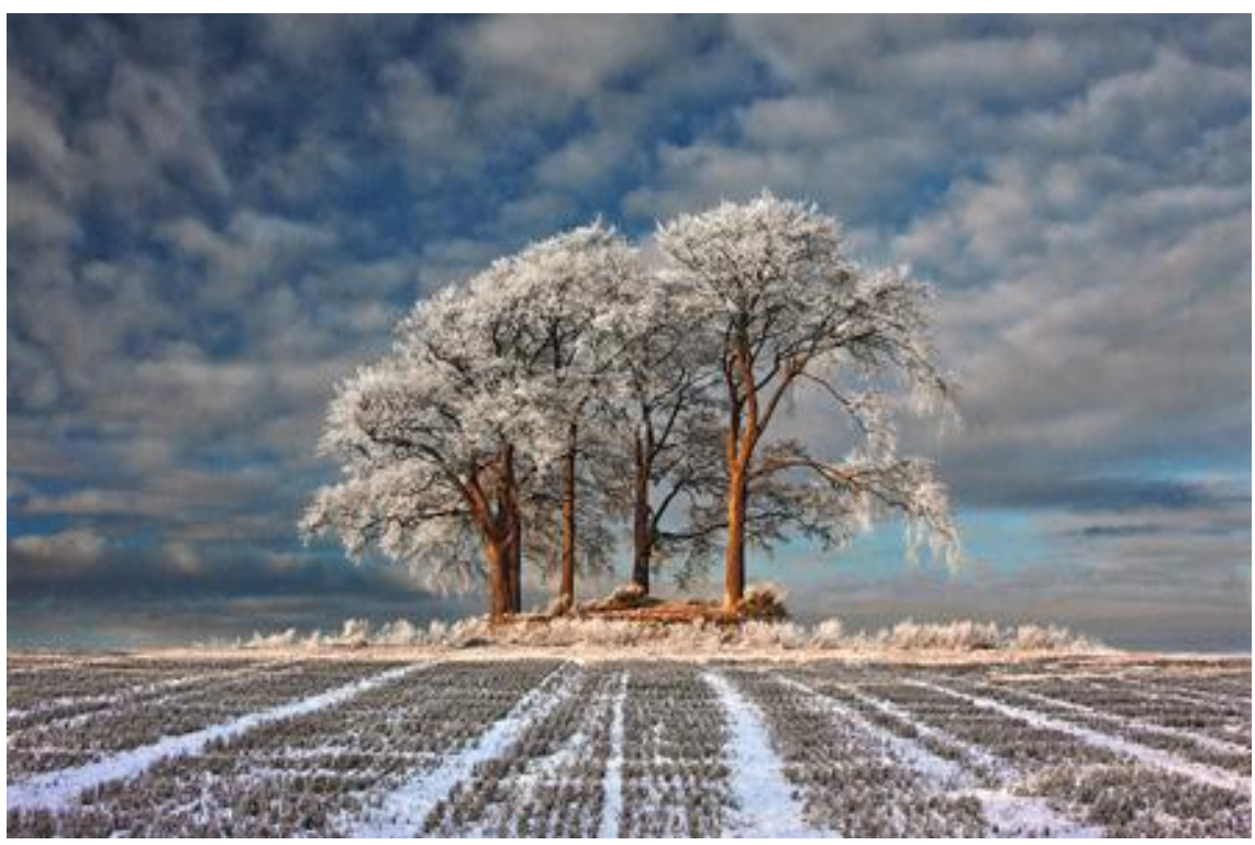
The winning photograph - Winter Field, Stirlingshire by Robert Fulton

The "Landscape Photographer of the Year – Collection 5" book is due to go on sale on from 31st Oct, followed by an exhibition of 100 prints at the National Theatre.