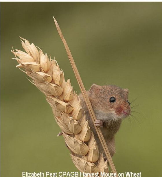
Elizabeth Peat CPAGB Harvest Mouse on Wheat