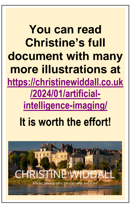
Page 5 of 14, e-news 348 14 January 2024