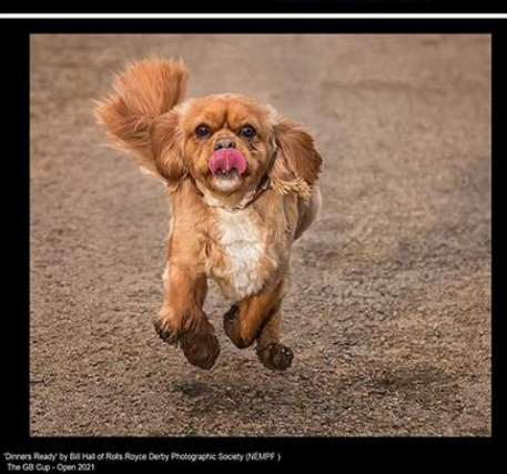
Previous Winners. Rolls Royce (Derby) PS.