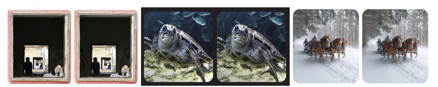
Yaal Herman, Israel