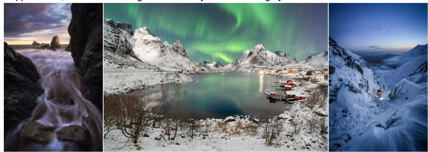
Copper Coast, Aurora over Village and Climb

Photography is the gift that keeps on giving... Since starting, I have travelled the world and seen it from both sides of the lens. I have met great people, shared amazing experiences, helped peoples dreams come true and have memories that will last a lifetime, all with like-minded people.