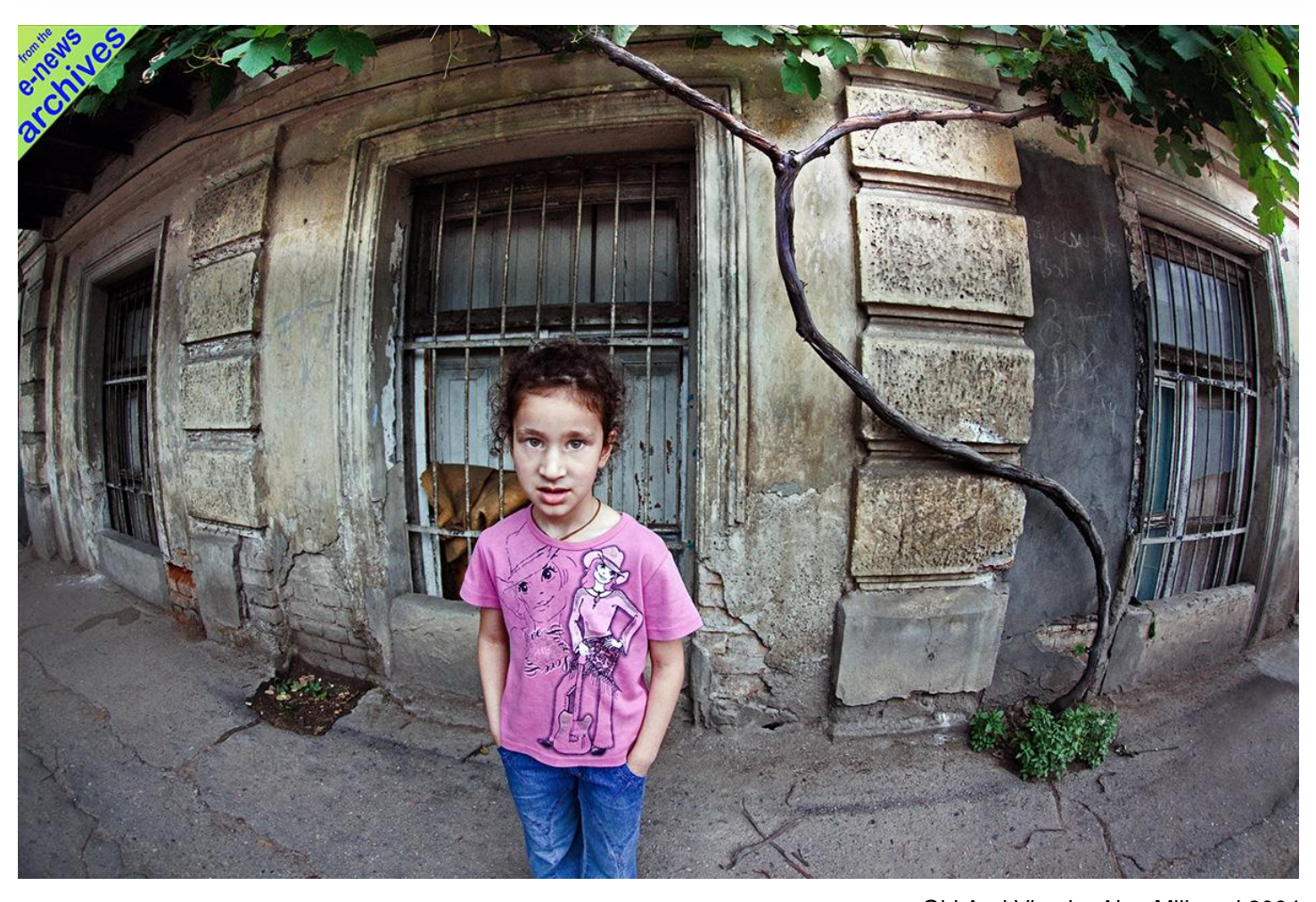
Girl And Vine by Alan Millward 2004

Book your Free Test Drive today at <a href="https://www.canon.co.uk/testdrive/">https://www.canon.co.uk/testdrive/</a>