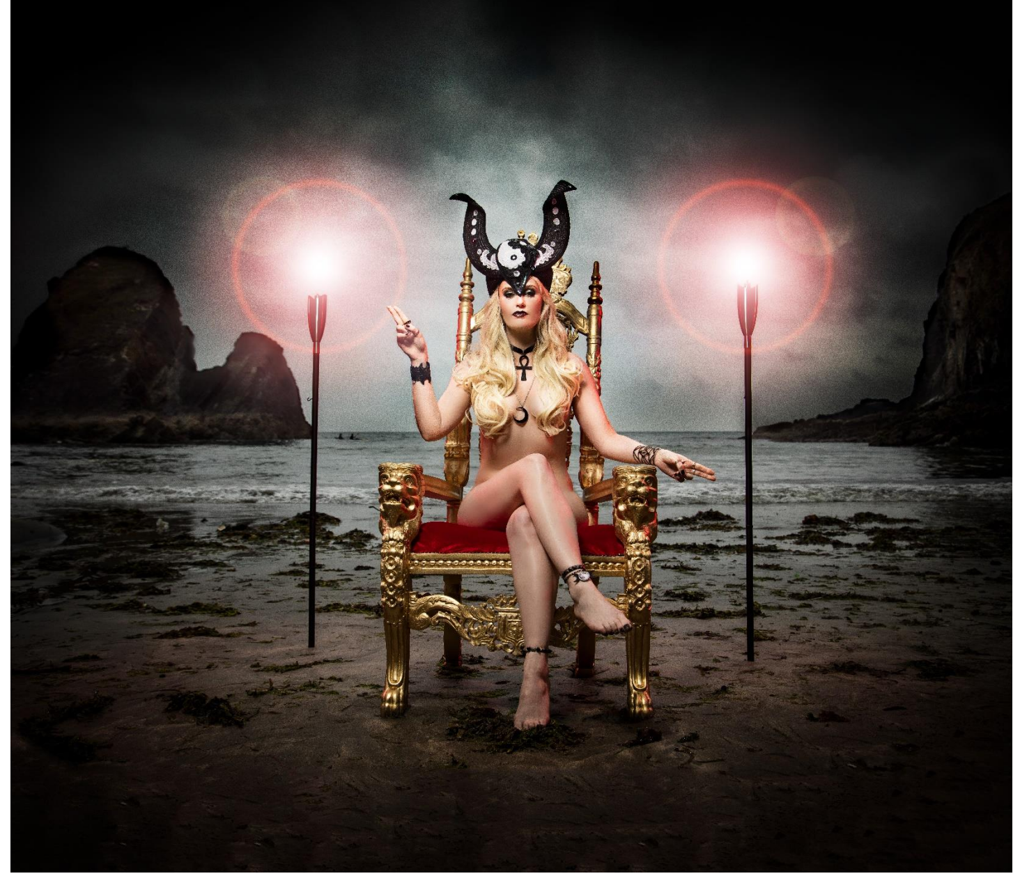
Disappointingly I have not been offered any May Day cover pictures but perhaps this shot by Michael O'Sullivan could represent the Queen of the May?