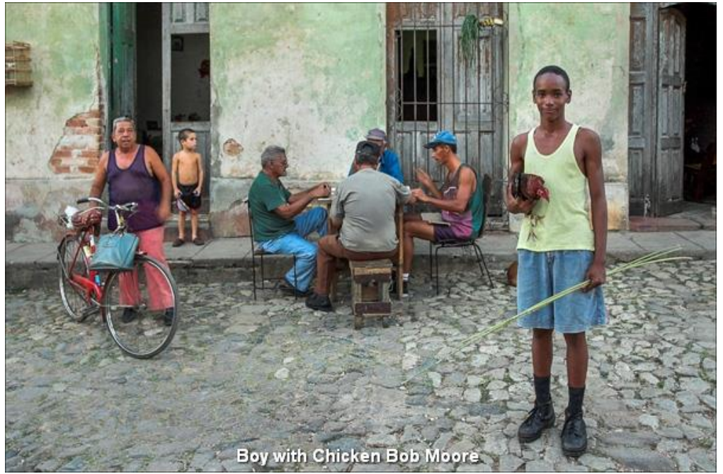
Page 3 of 15, e-news 242 Nov 2019