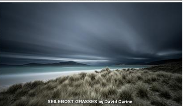
More pictures by the Finalist Clubs in later issues of e-news