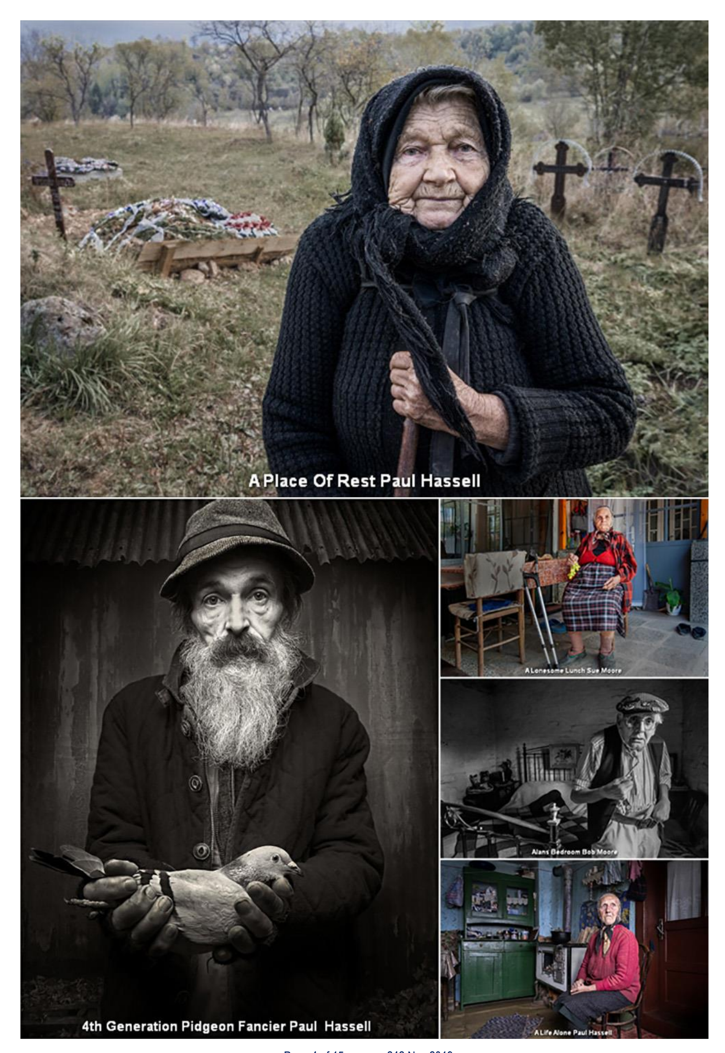
Page 4 of 15, e-news 242 Nov 2019