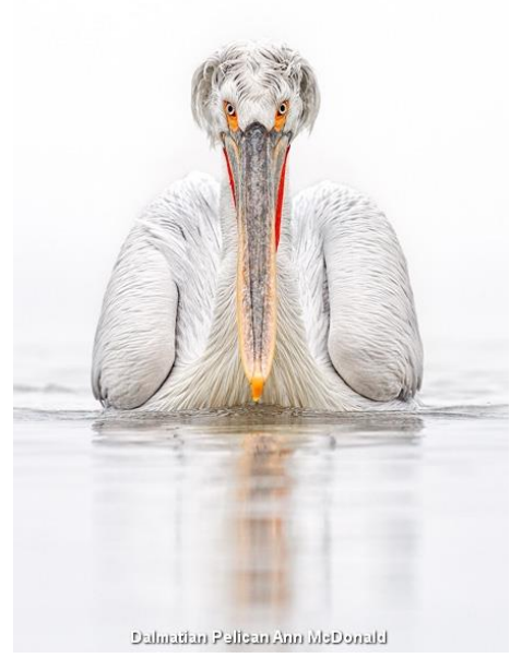
Page 5 of 15, e-news 242 Nov 2019