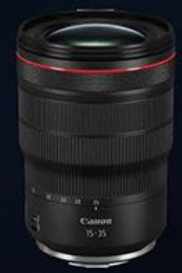
RF 15-35mm f/2.8L IS USM