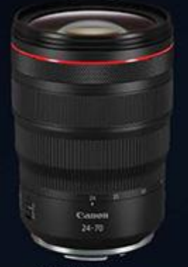
RF 24-70mm f/2.8L IS USM

https://www.canon.co.uk/cameras/eos-90d/