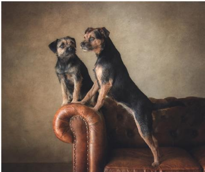
Bonnie & Bella by Barrie Spence

Welcome to one of the most highly regarded international exhibitions in the UK, typically attracting around 3000 entries from all around the world. This salon has been in existence for over 150 years, and during that time has built a strong reputation. We are a print-only exhibition, increasingly rare in these times. Unlike many print exhibitions, we only accept what we can display, thus gaining an acceptance is a high achievement much sought after. All the prints are on display at the Society's premises during the Edinburgh Festivals for 4 weeks in August, maintaining the success of recent years. The Exhibition usually receives over 3000 visitors, many of whom come year after year to view it. All accepted images appear in the catalogue which has had a FIAP 4* rating since 2013.