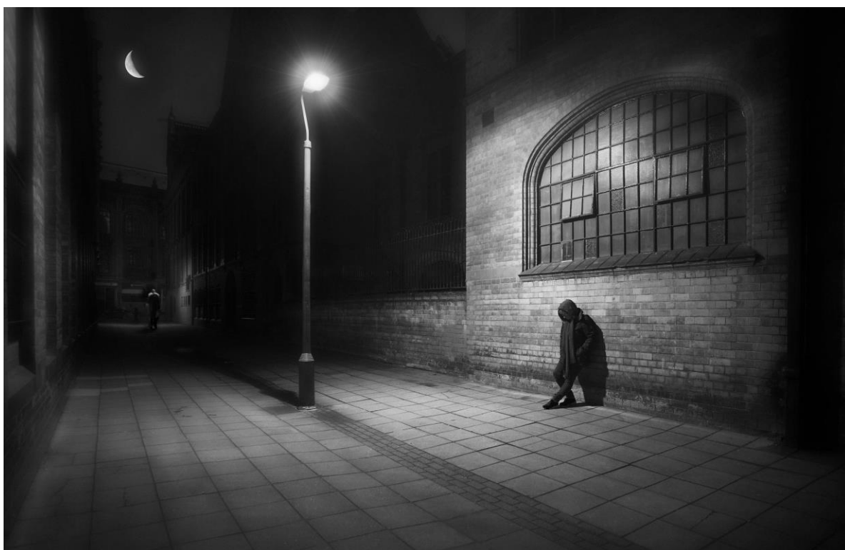
“Waiting” by Lorraine Hardy