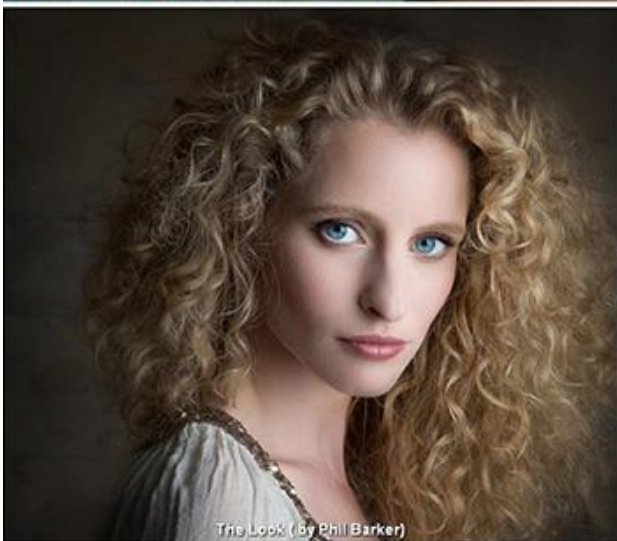
The Look