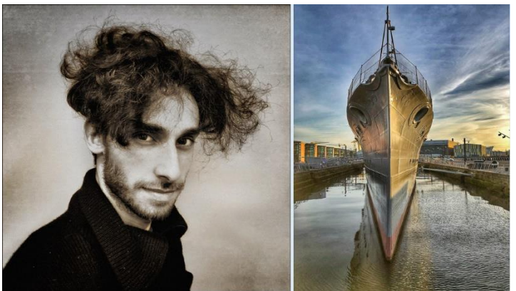
"Bad Hair Day" & "HMS Caroline" by Rod Wheelans