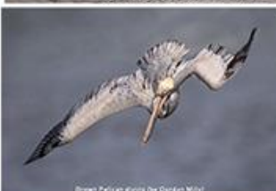
Brown Pelican