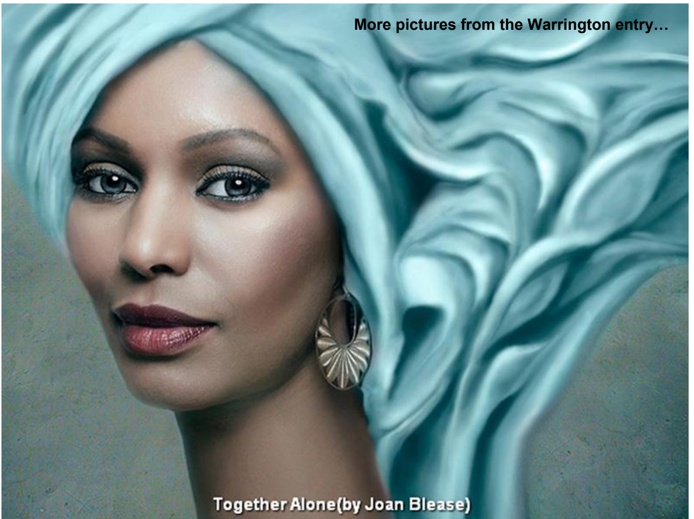
Together Alone