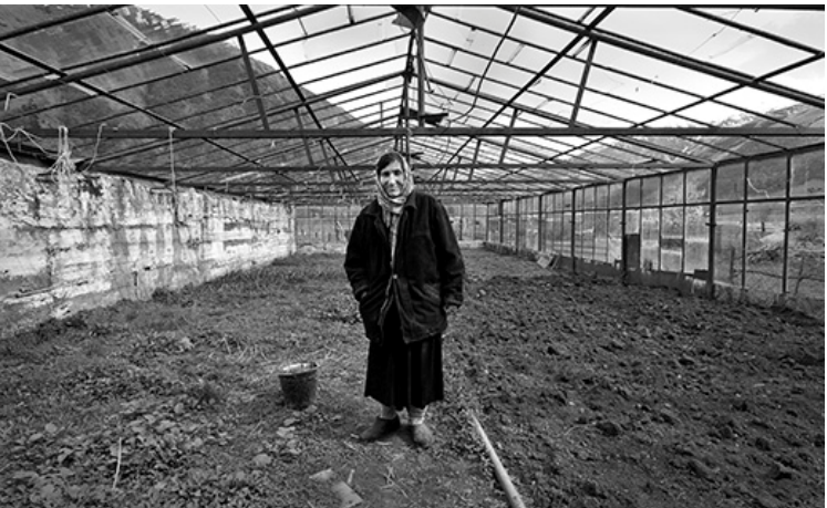
Page 13 of 15, e-news 208. 1Jun 2018