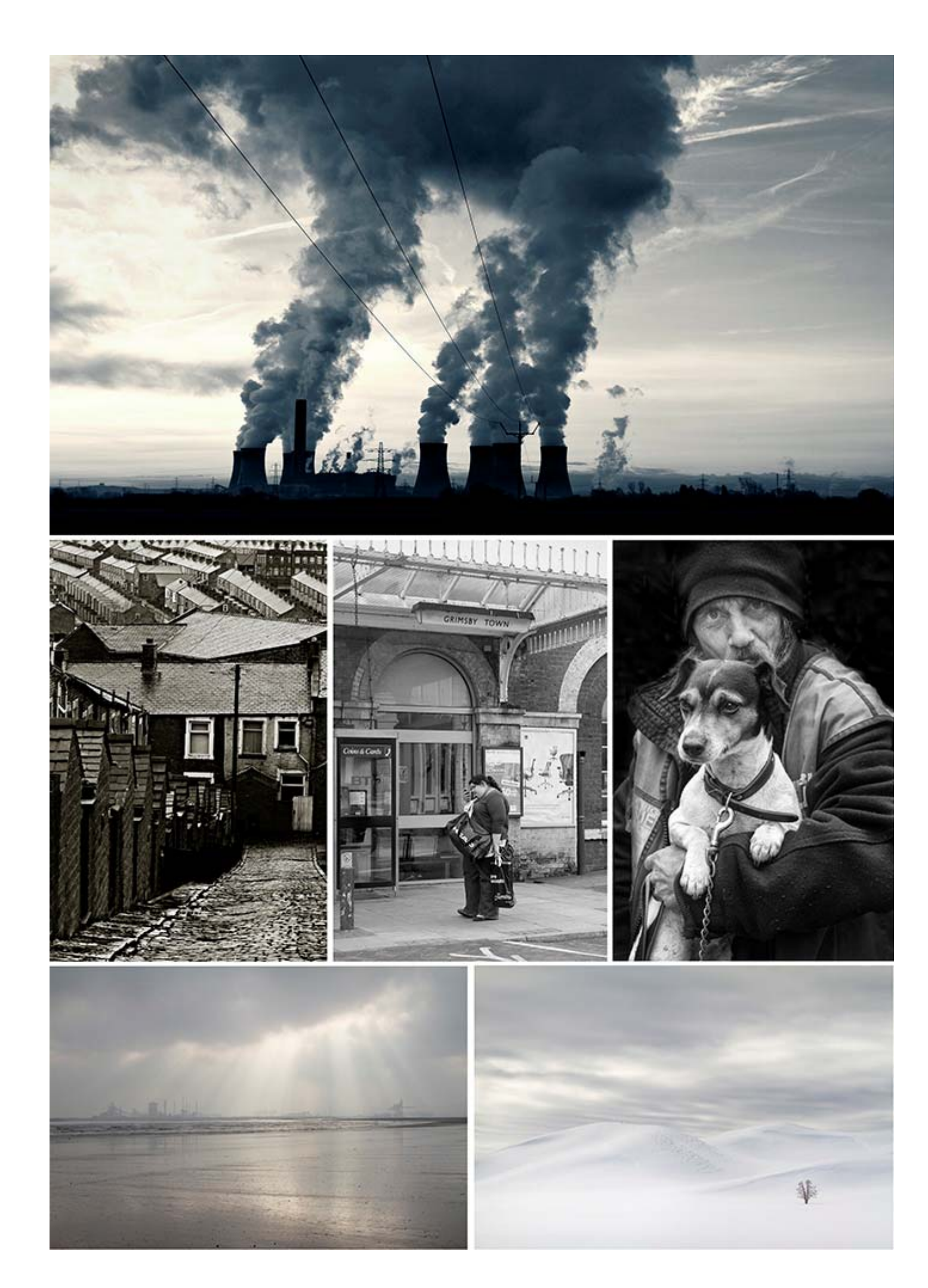
Page 12 of 15, e-news 208. 1Jun 2018