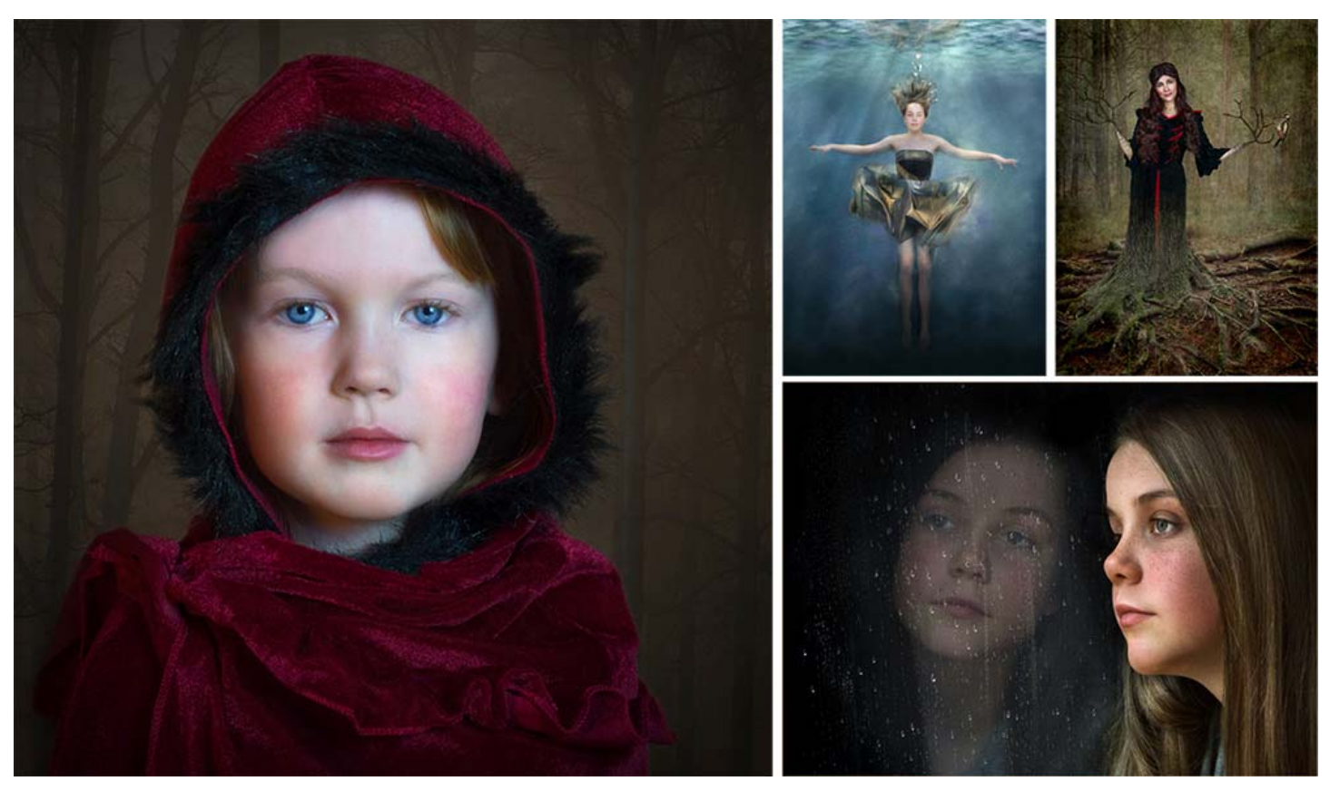
Pictures by Jo Knight. "Ruby", "Beneath the Waves", "Rooted" and "Waiting for the Rain to Stop"

CLICK ON the pictures to view them more comfortably on the e-news website and see more at <a href="https://penrithcameraclub.co.uk/galleries-2/">https://penrithcameraclub.co.uk/galleries-2/</a>