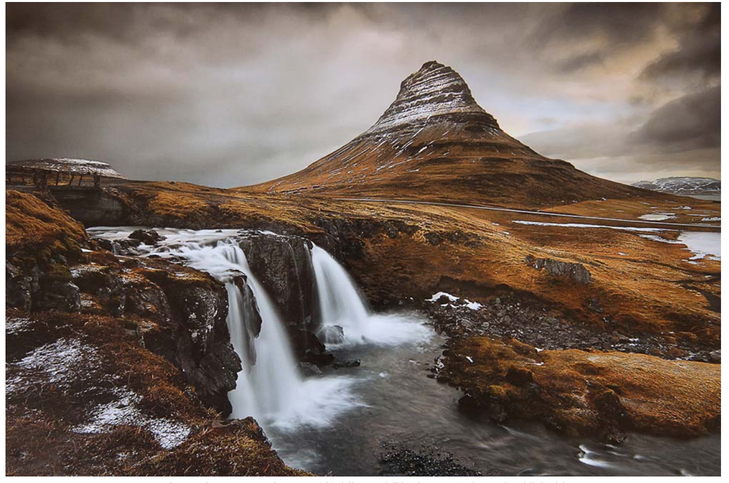
GB Trophy - Best Landscape. Kirkjufell Waterfall