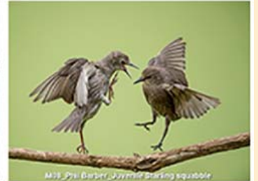
M08_Phil Barber_Jivvies sharing squab