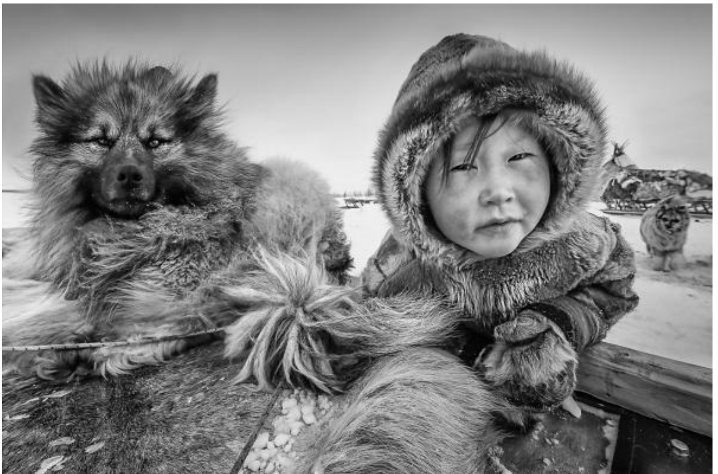
Little Nenets by Segrey Animov, Russia

http://www.scottish-photographic-salon.org/results