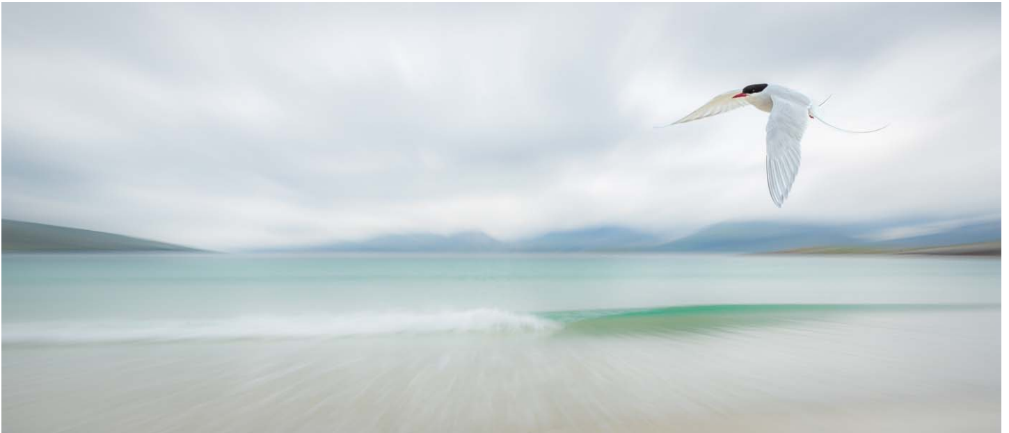
Arctic Tern over Luskentyre

M I D S U M M E R D A Y . Astronomically, midsummer is the day of the summer solstice, the longest day, which usually falls on June 20 or 21. The last time it did not fall on either of those dates was in 1975 when it was June 22. However, we recognise 24 June as Midsummer Day because the date was set when the Julian calendar was in operation, and it was wrong by a few days.