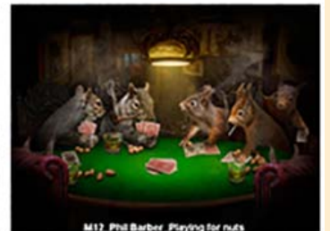
M12_Phil Barber_Playing for nuts