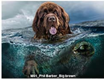
M01_Phil Barber_Big brown