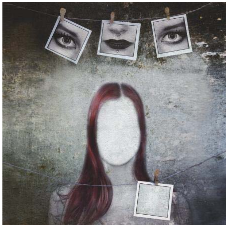
Captured Soul by Rikki O'Neil, Scotland