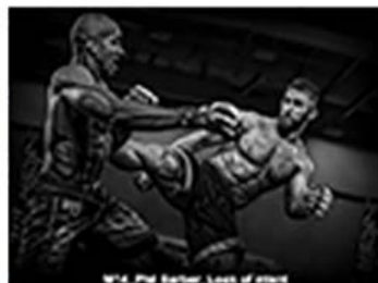
M14_Phil Barber_Look of amon