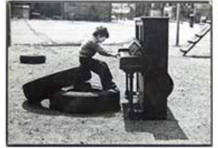
Piano Kid.jpg