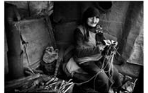
Knitting Lady by Rod Wheelans.jpg