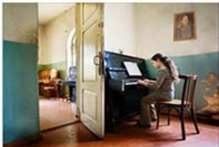
Piano Practice by Arne Greiner.jpg