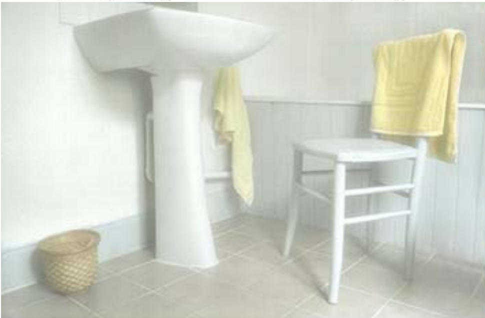
Splash of Yellow by Irene Froy