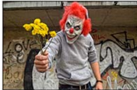
Here Little Boy by Russell Lindsay.jpg