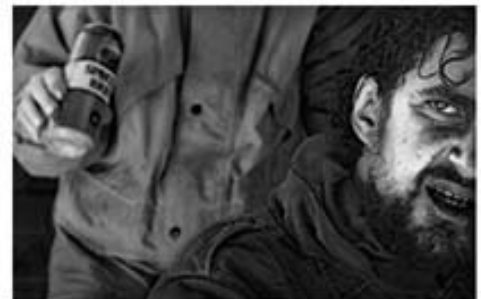
Devils Brew by Colin Trow Poole.jpg