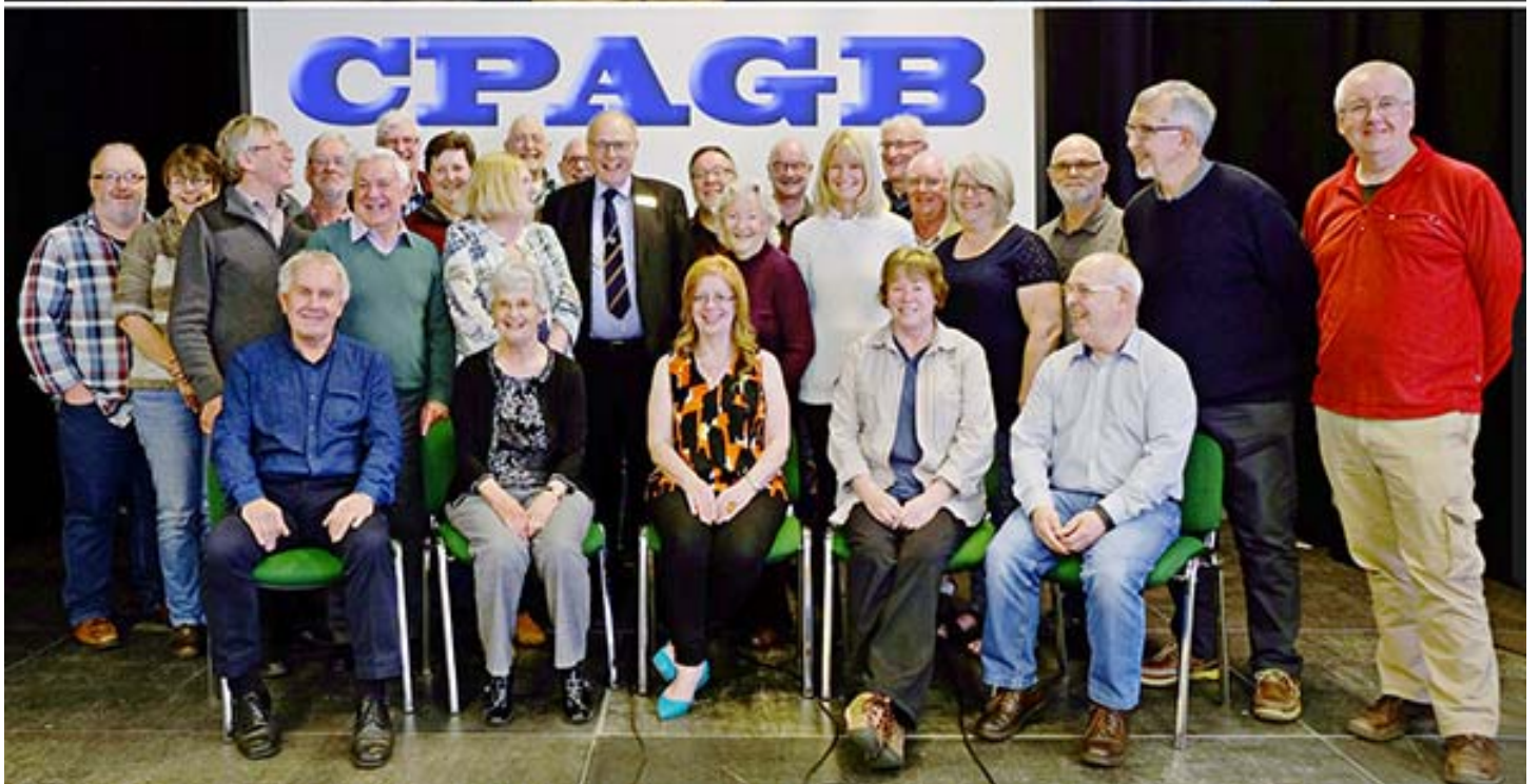
Just some of the many successful CPAGB and DPAGB Applicants at Gateshead.