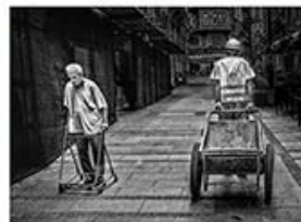
SM22_L Alani_Wheel Power.jpg