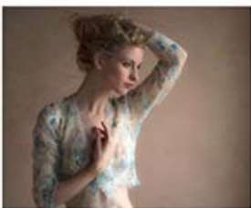
SM18_D Jayes_Effortless beauty.jpg