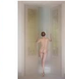
SM11_J Parry_Celestial Light.jpg