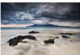
SM29_M Sharples_Laig bay storm clouds.jpg