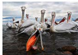
SM03_M Tabner_Dalmation Pelican fishing.jpg