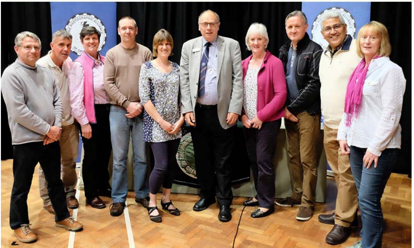
Successful CPAGB and DPAGB entrants pictured with the PAGB President at Southampton in April