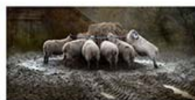
SM33_B Hawthorne_The Feeder.jpg