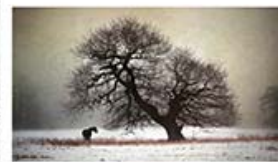
SM24_B Hawthorne_Two silhouettes.jpg