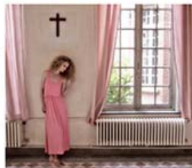
SM09_R Parry_Beneath the Cross.jpg