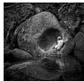
SM13_T Pile_Circle Of Beauty.jpg