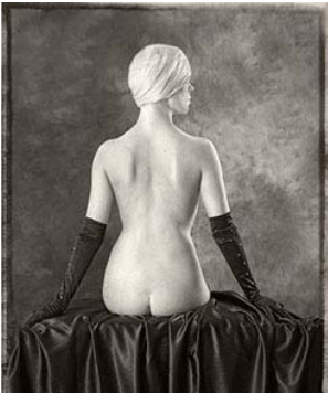
A Nod to Man Ray