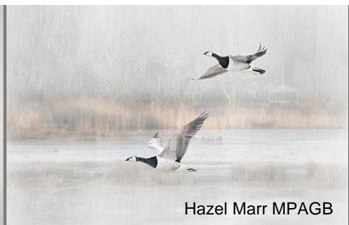
Hazel Marr MPAGB

We will feature the full MPAGB panels of all four successful applicants in later issues of e-news.