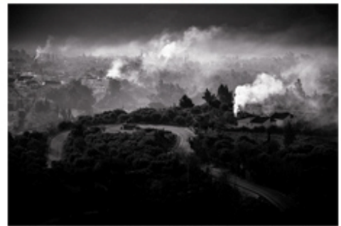
Morning Fires – Orgiva, Granada December 2013