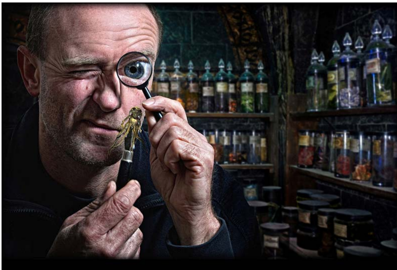
GB Cup 2014 Open - Best Portrait