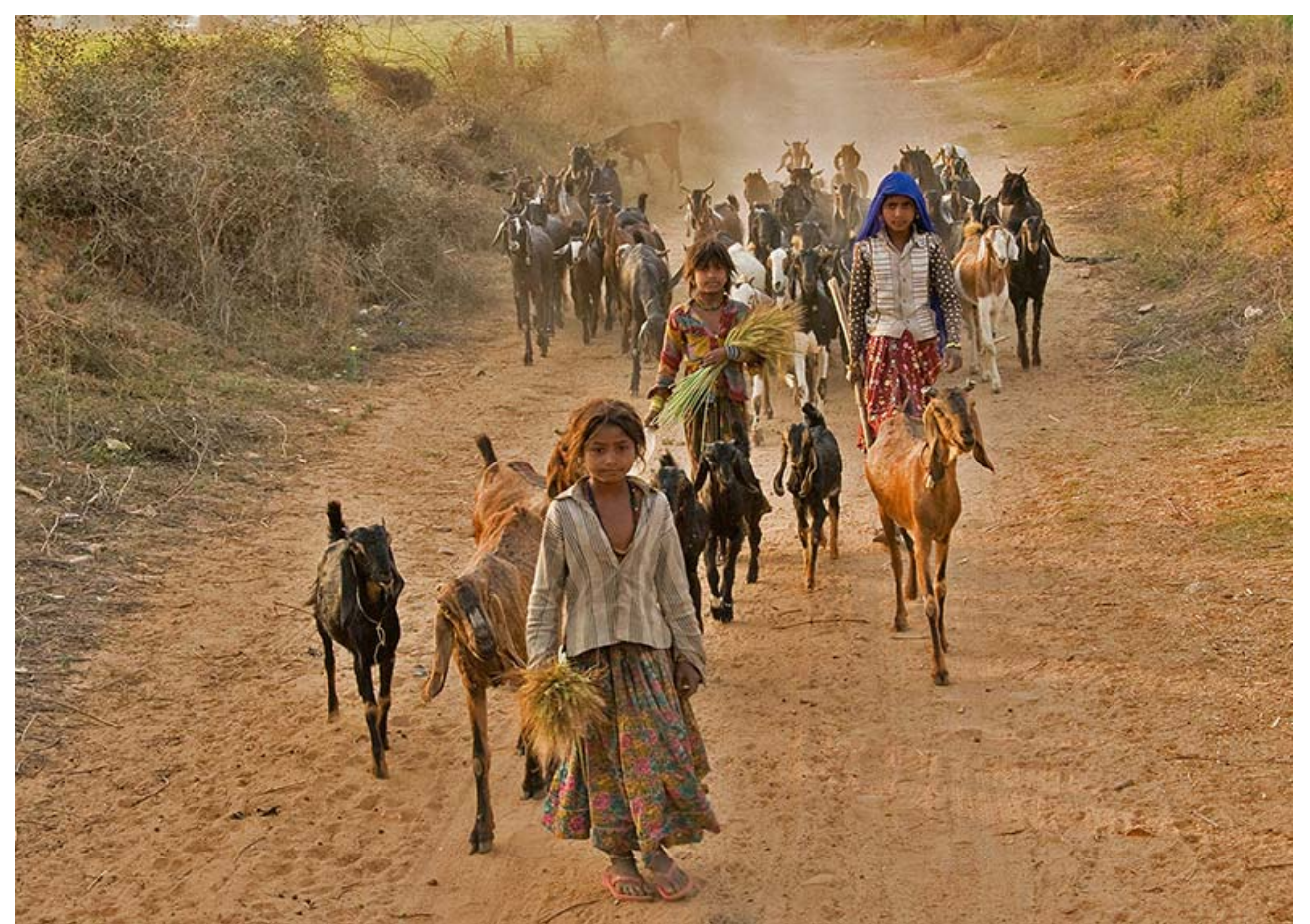
On their way home by Leo Rich DPAGB APAGB EFIAP/g ARPS Page 4 e-news 110 Feb 2014

I am very positive about the future of club photography in the UK. There are many more people discovering photography through modern communication facilities such as mobile telephones and iPads and a proportion of these will wish to expand their own photographic horizons. With the ability to manipulate images in software packages a whole new group of photographers is emerging and it is nice to see that many more ladies are flexing their creative minds and producing some wonderful images. It is up to the clubs to prepare themselves for the new generation, to give them the support they seek and to make potential members feel at home. Leo Rich, PAGB President