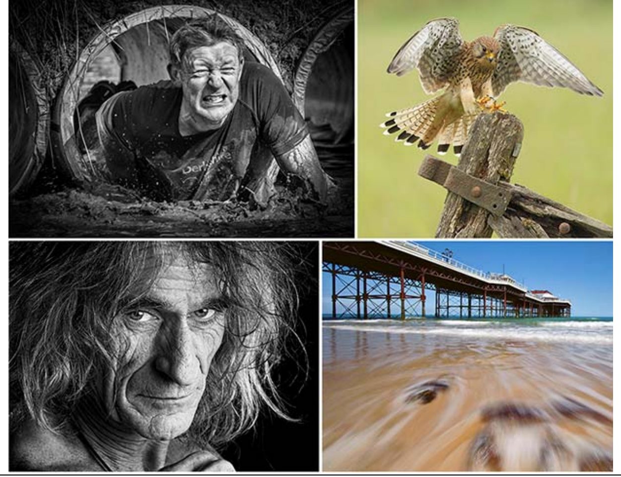
Page 2 e-news 110 Feb 2014