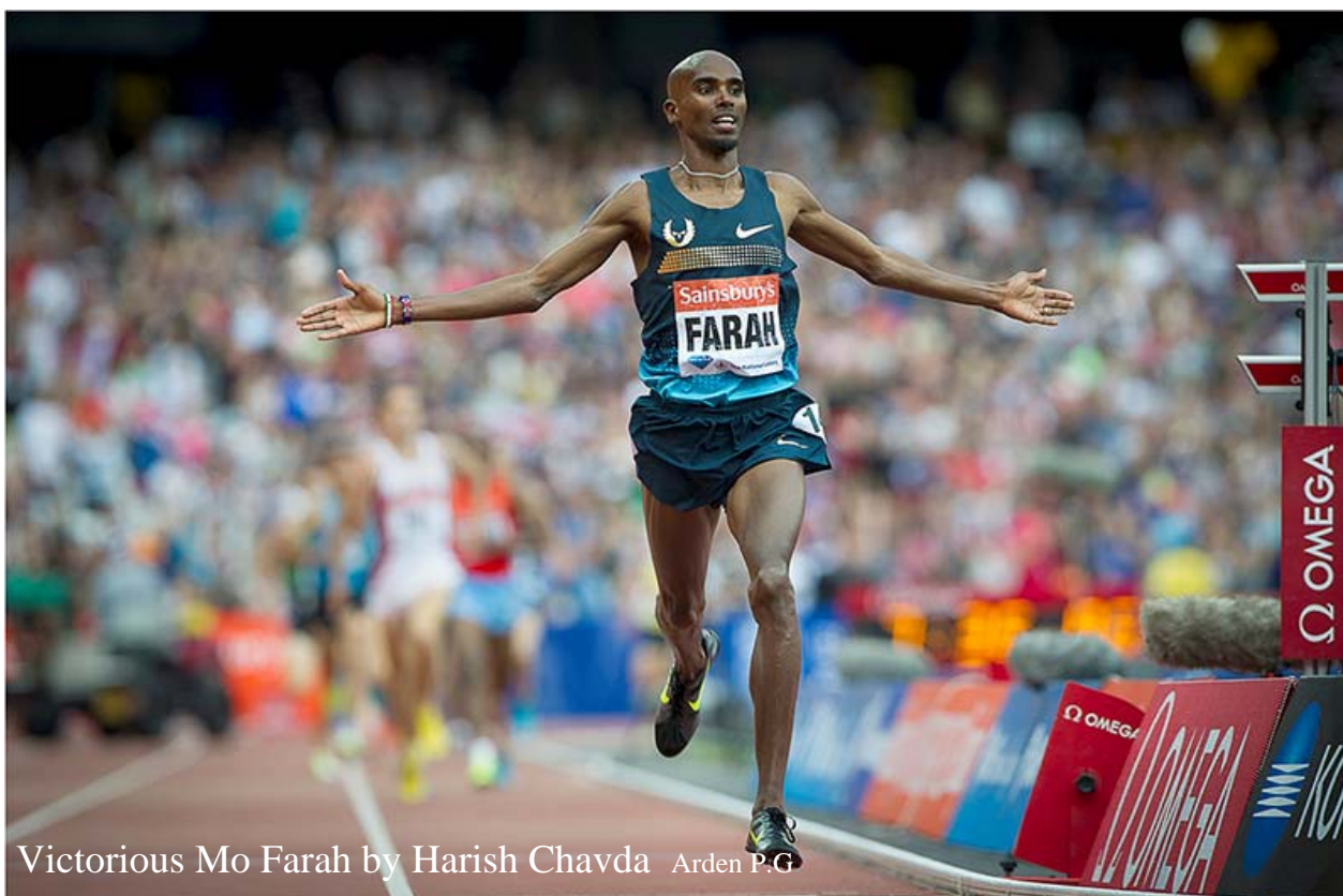
Victorious Mo Farah