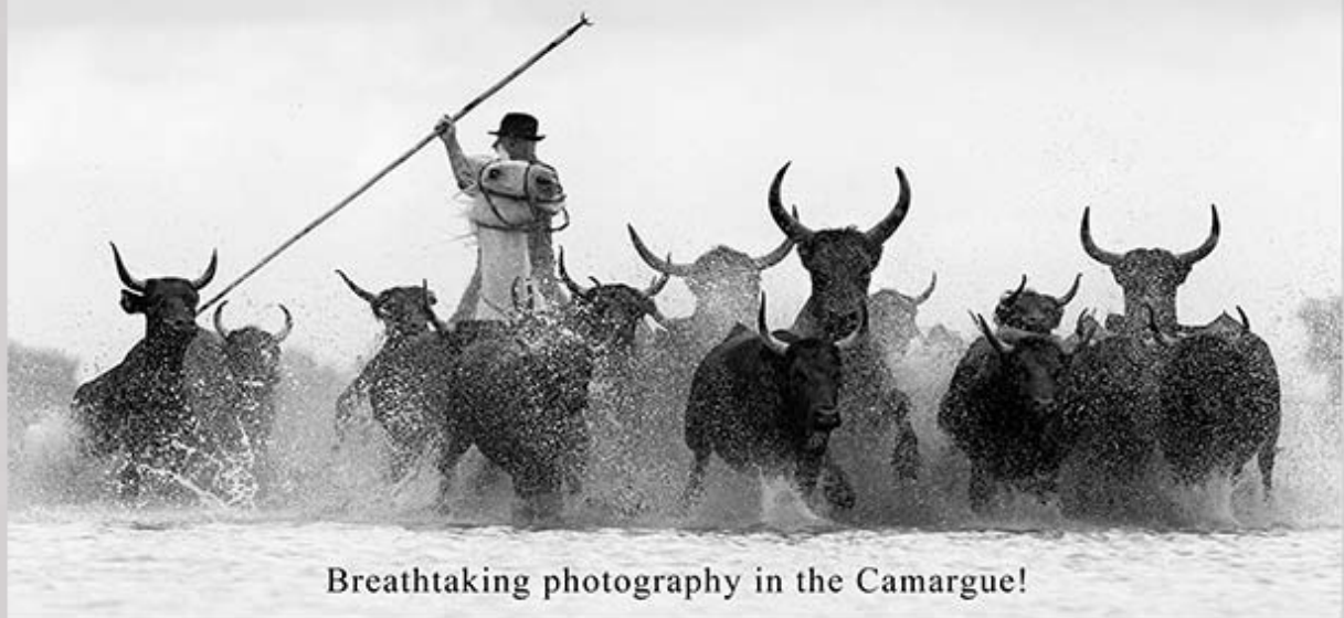
Breathtaking photography in the Camargue!

Looking for a new challenge? We have been working hard to offer you new & exciting destinations with some incredible shoots. New for 2014/15: