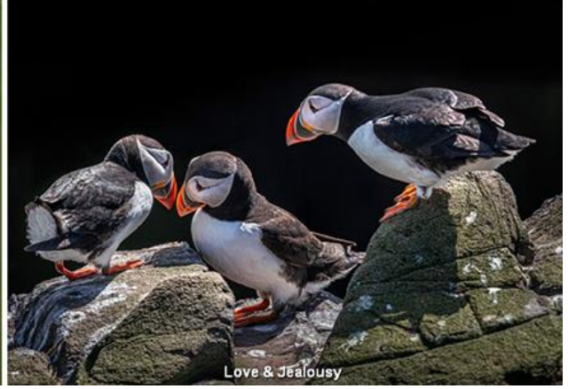
More photographs by Peter Cox.