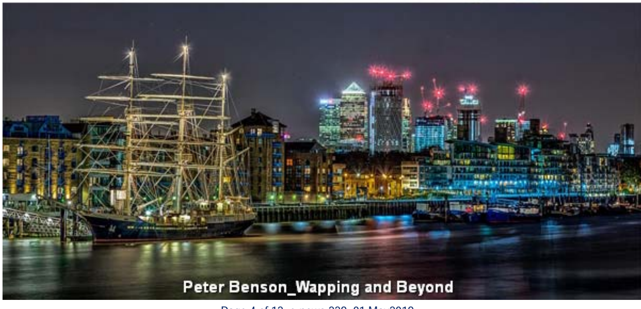
Page 4 of 12, e-news 229. 01 May2019