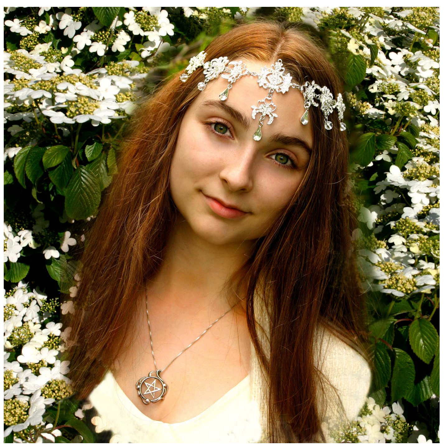
May Queen