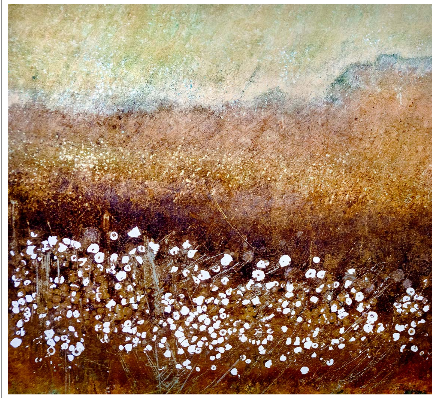
Wayside Flowers by Heather Woodhams, a 2018 London Salon Medal winner

See the notice in this e-news, for details of the London Salon 2018 exhibition venues