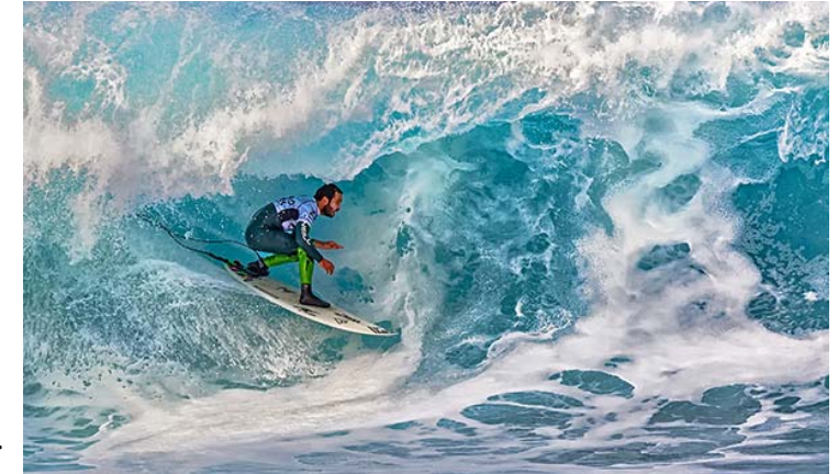
CLICK ON the pictures to see them on our website.