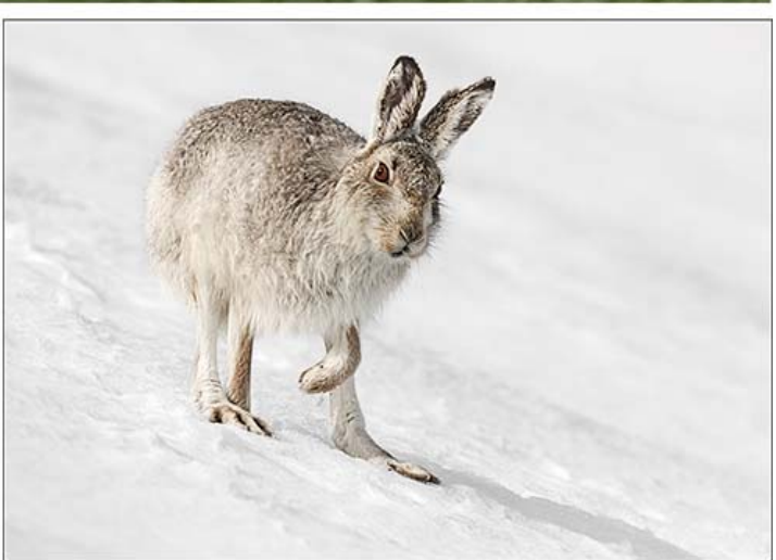
CLICK ON the pictures to view lan's entire entry on our website.