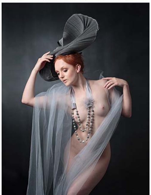
CLICK ON the pictures to view Hugh's entire entry on our website.