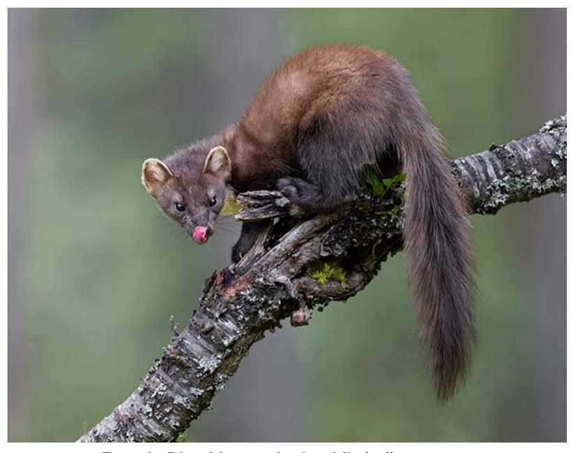
"Female Pine Marten"