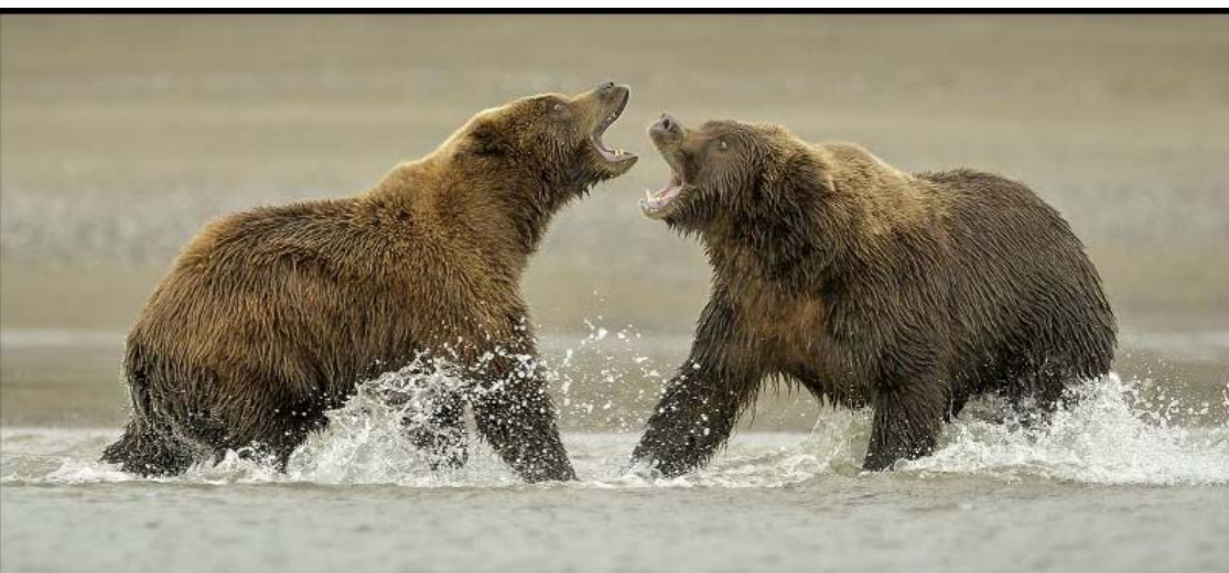
Best Confrontation, 'Brown Bear Fight', Gordon Rae, Dumfries Camera Club (SPF ) Nature - The GB Cup for Nature 2018

View the pictures, and more, on our website at http://www.thepagb.org.uk/competitions/great-british-cup/