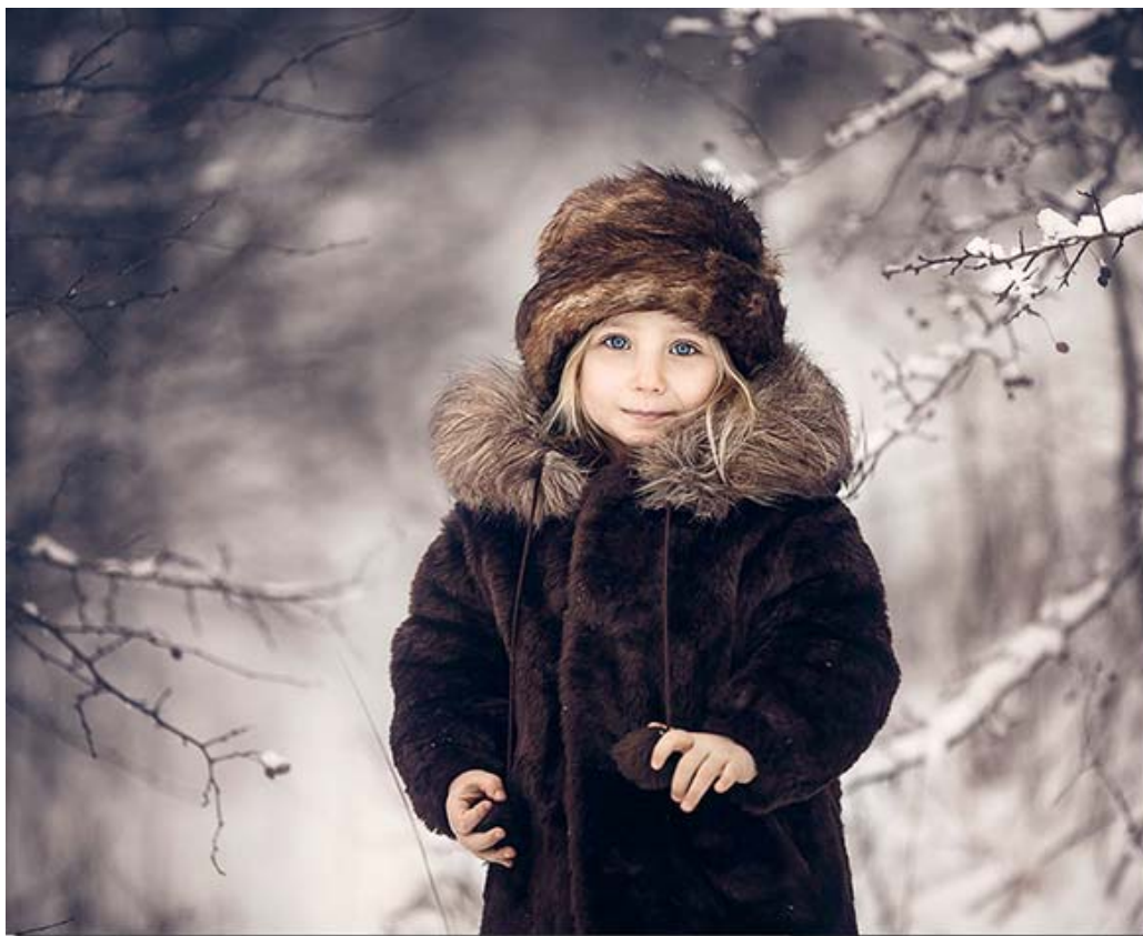
2017 Photographer of the Year Silvershotz March magazine