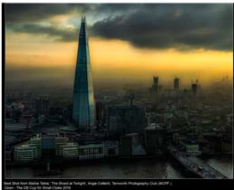
Angie Cotterill_The Shard at Twilight